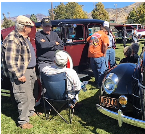
Socializing and relaxing at the car show