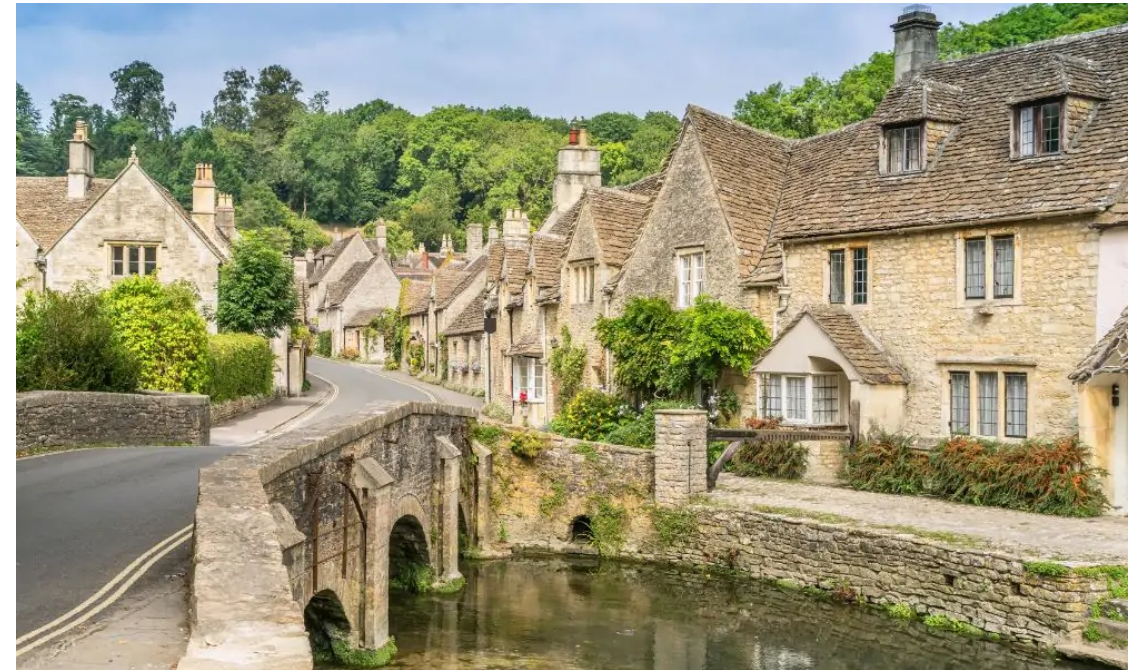
This is a view of a typical section of the Cotswold Region in England. Notice how similar Edsel's mansion is to this quaint articture.