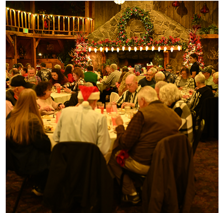
...and more members...