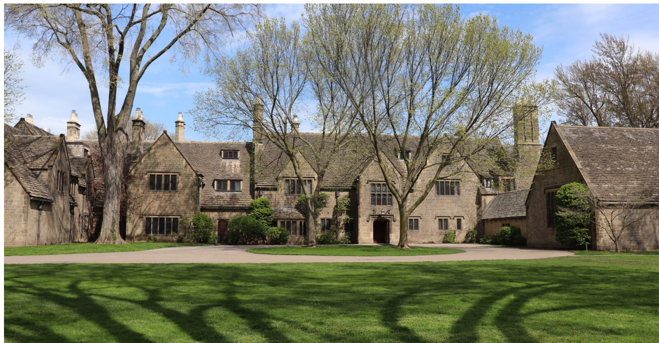
The front and main entrance way of the Edsel Ford mansion.

The magnificent home was completed in 1929 (this is what Model A money could buy), and Edsel lived there until his death in 1943, and Eleanor lived there another 33 years. In her will, Eleanor set her home up as a museum and left $10 million for its upkeep. Today, almost 50 years after her death, the home is still a museum and is open year-around for tours.