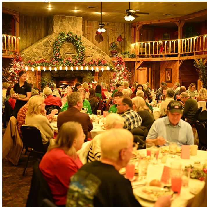
Members enjoying a delicious Christmas dinner at the Timbermine Restaurant...

The only drawback to the annual Christmas party is that they seem to come around WAY TOO QUICKLY!