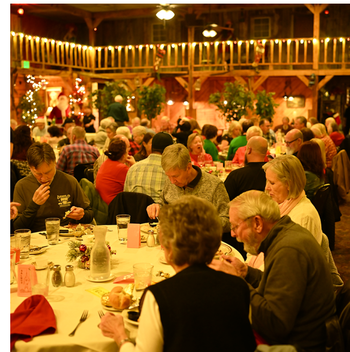
...and more members.