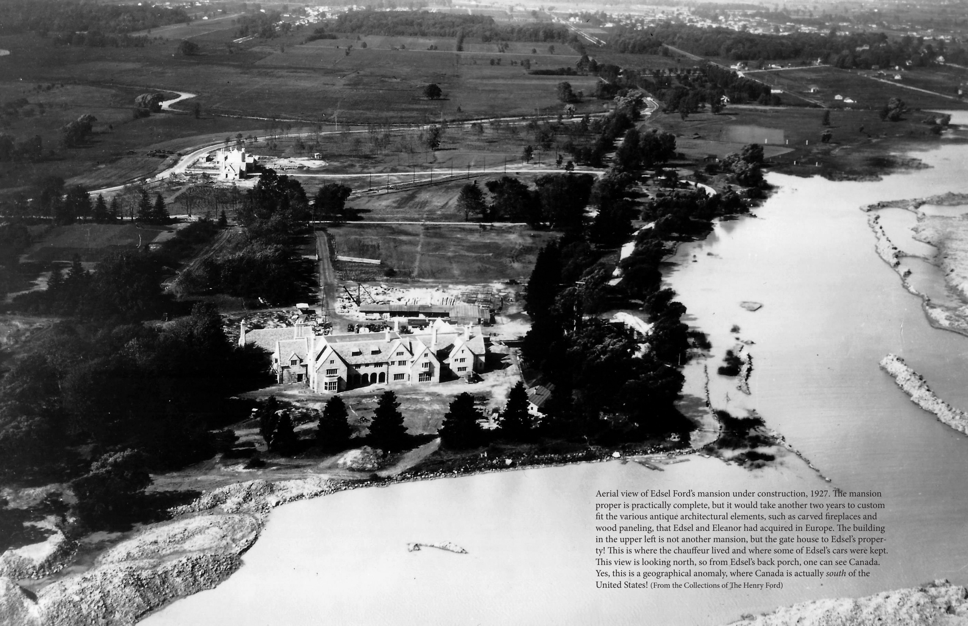
Aerial view of Edsel Ford's mansion under construction, 1927. The mansion proper is practically complete, but it would take another two years to custom fit the various antique architectural elements, such as carved fireplaces and wood paneling, that Edsel and Eleanor had acquired in Europe. The building in the upper left is not another mansion, but the gate house to Edsel's property! This is where the chauffeur lived and where some of Edsel's cars were kept. This view is looking north, so from Edsel's back porch, one can see Canada. Yes, this is a geographical anomaly, where Canada is actually south of the United States!