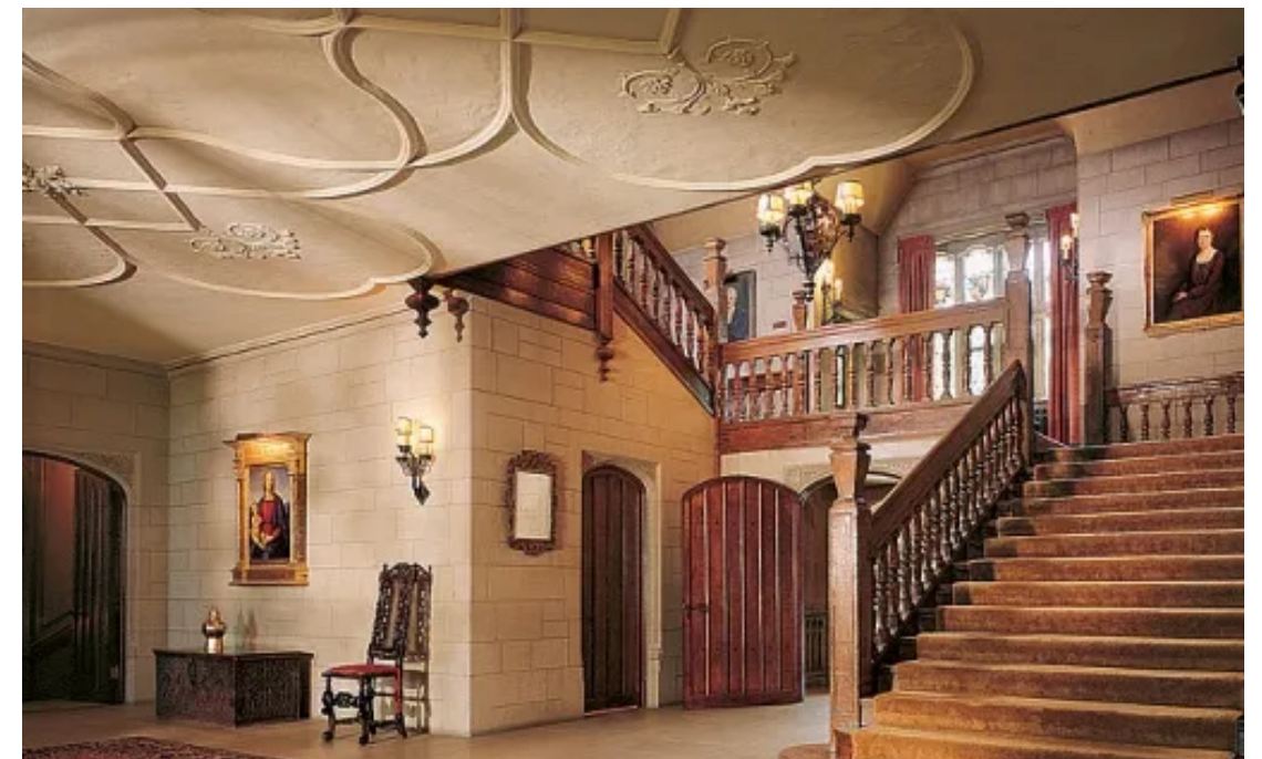
Entry way of the mansion. Visitors entering the large door were met with an expansive tile floor, warm Persian rugs, and a medieval banister.