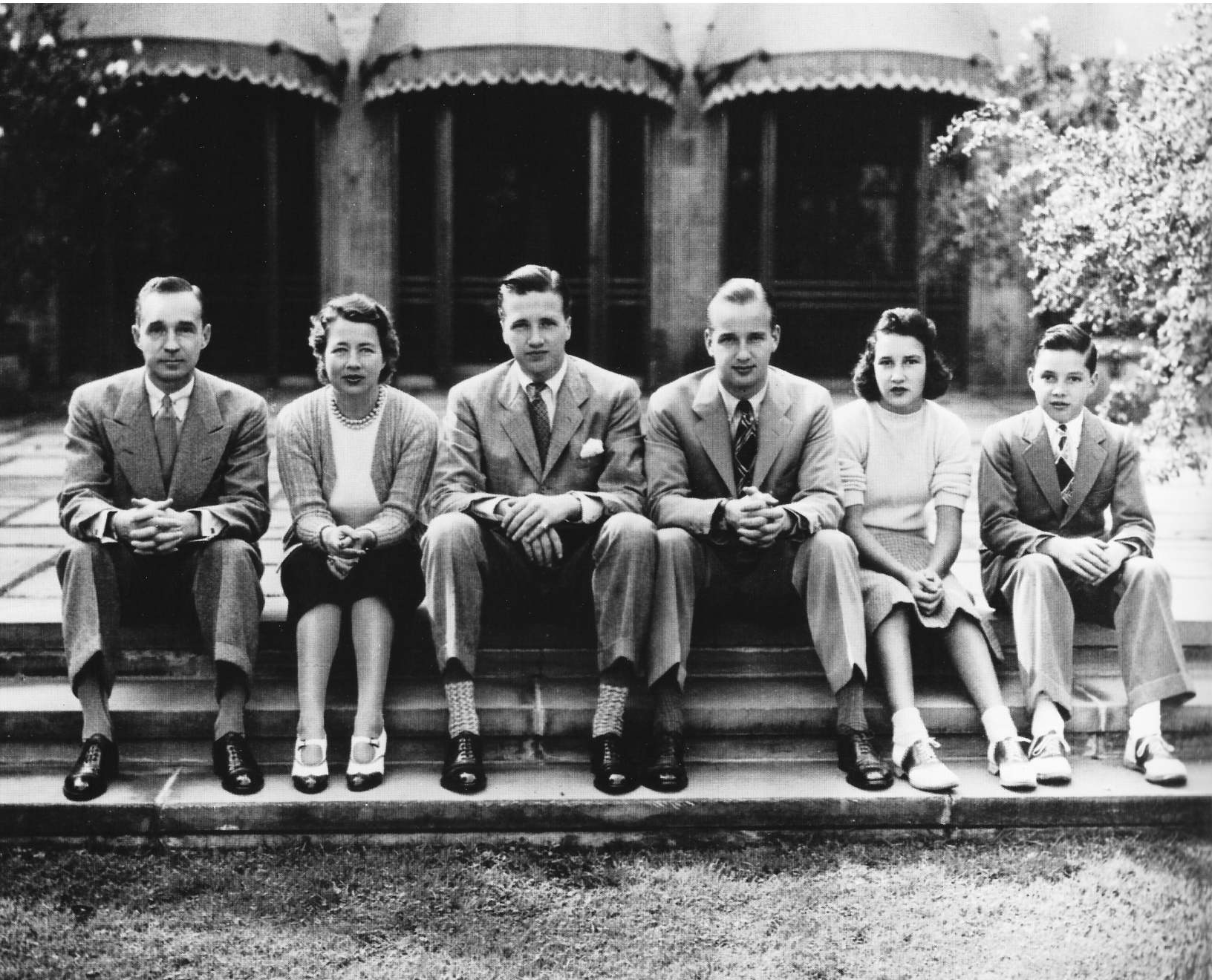
The Edsel Ford family posing on the patio steps of Gaukler Pointe, circa 1938 (L-R): Edsel, Eleanor, Henry II, Benson, Josephine, and William. Interestingly, and somewhat baffling, in this huge mansion, young Henry had his own bedroom suite, as did Josephine, but Benson and Willam shared a bedroom!