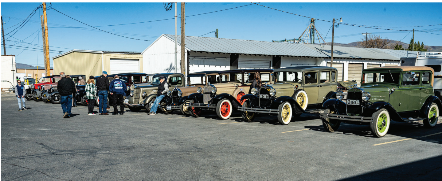
The troop all made it to The Grill Restaurant in Tremonton, as was the plan. Here they are lined up in the restaurant's parking lot.