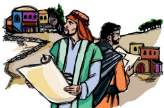
The Wise and Foolish Builders Matthew 7:24-27 | Luke 6:48-49

In Matthew 7, Jesus tells the story of the wise and the foolish builders. He says the foolish builder builds on sand. He is like the guy who hears the Word of God but doesn't do what it says. The wise man builds on a solid foundation because he hears God's Word and then goes out and makes an honest attempt to apply it in his life.