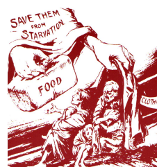
THE GREAT CHICAGO REFUGEE RESCUE

The cost of this interesting book is only $17.50 plus shipping and handling.