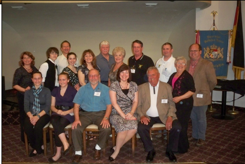
The Forgotten Genocide Conference – Friday, Saturday, April 20th & 21st (From the UGH June 2012 Monthly Progress Newsletter )

Many important events have taken place at our club over the years. One hundred years is a long time and maybe in the future, we will go over some of these events. Often when they are happening, we do not realize how important they really are. However, the conference that took place at our club in April ranks among the most important events that took place throughout our history. I am not going to go into great detail as we advertised in our March and April issues in great length. But, it was a most interesting and informative two days. Many only attended for one day, but many attended both days. The speakers were well informed and spoke with passion and zeal. After each speaker a film was shown. The film series began with the history of various groups of German peoples who migrated to the eastern European countries beginning in the year 1000 and came forward to the year 1943.