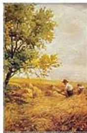
"Sommer" by STEFAN JÄGER

Do you see the man standing in the distant fields? His hat upon his head keeps out the hot sun as he toils in those fields, his fields. There is sweat upon his brow and a satisfied smile on his face after a hard and happy day's work. The wind blows by him in his beautiful homeland. A land he traveled for; a land he and his sons work on everyday. Do you hear his laughter as he looks upon the beautiful face of his wife and daughters as he arrives home?