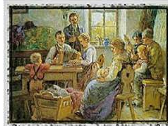
"Schwäbisches Hauskonzert" by STEFAN JÄGER

They all sit down at the table sharing not only the hearty meal but each other's company. They stop once before they eat to give thanks to their heavenly father, for giving them this food, this family and this promised land. The food on this table is home grown and raised. It is prepared with care and practice from recipes passed down from generations.