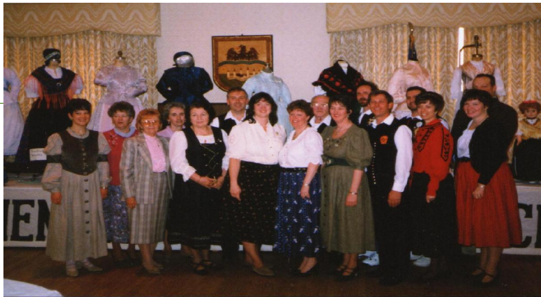
2000 Donauschwaben Heritage Festival Philadelphia Donauschwaben