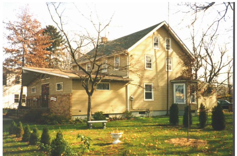
Trenton Donauschwaben Clubhouse