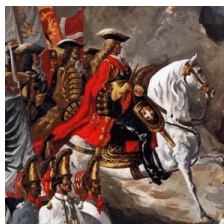
Prince Eugene liberates the Banat-Batschka area

The Club is developing a voluntary data base of it's members and a brief section on their ancestral roots. For those interested, we are interested in