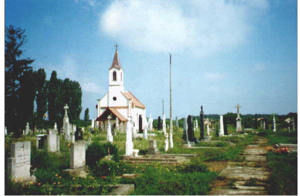
The Roman Catholic Chapel in Palanka

Your time and consideration are appreciated in advance of your donation. The Club will be given a copy also.