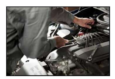
Car Care: Caring for Your Timing Belt or Chain A little time can save you a lot of money.

The timing belt or chain is one of the most important maintenance items on an automotive engine, yet it is frequently the most neglected. Failure to follow the required maintenance schedule for the timing belt or chain can lead to very expensive repairs to other engine components.