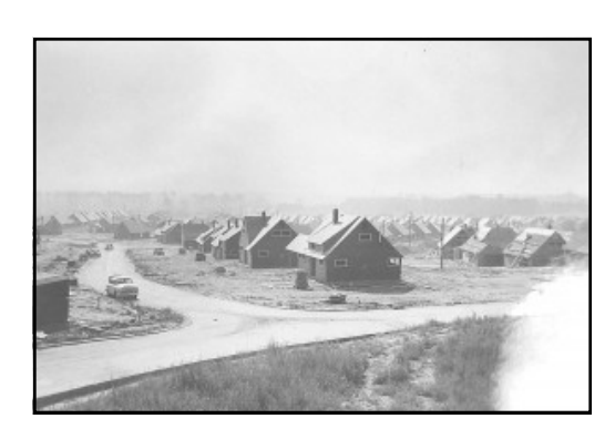
Levittown, PA turns 60

Levittown, Bucks County, PA celebrated it's 60th anniversary on 23-24 June 2012. Built from 1952-1958, it consisted of over 17, 000 homes and covered parts of Falls Township, Bristol Township, Tullytown Boro and Middletown Township.