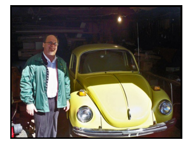
MARTINI BUG on the ROAD

Permission granted, VW of Langhorne, August 2011 newsletter.