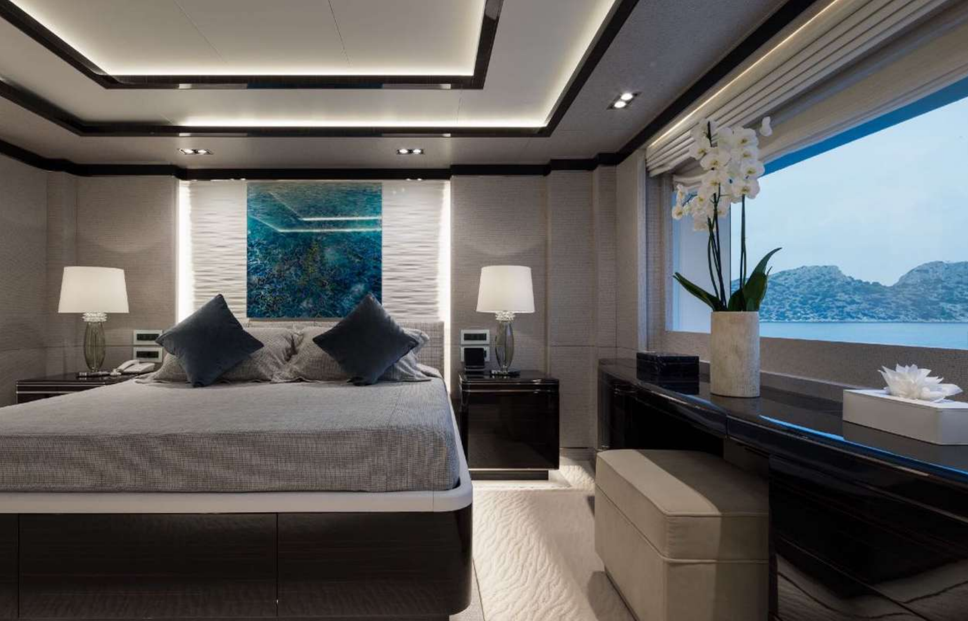
GUEST CABIN 3