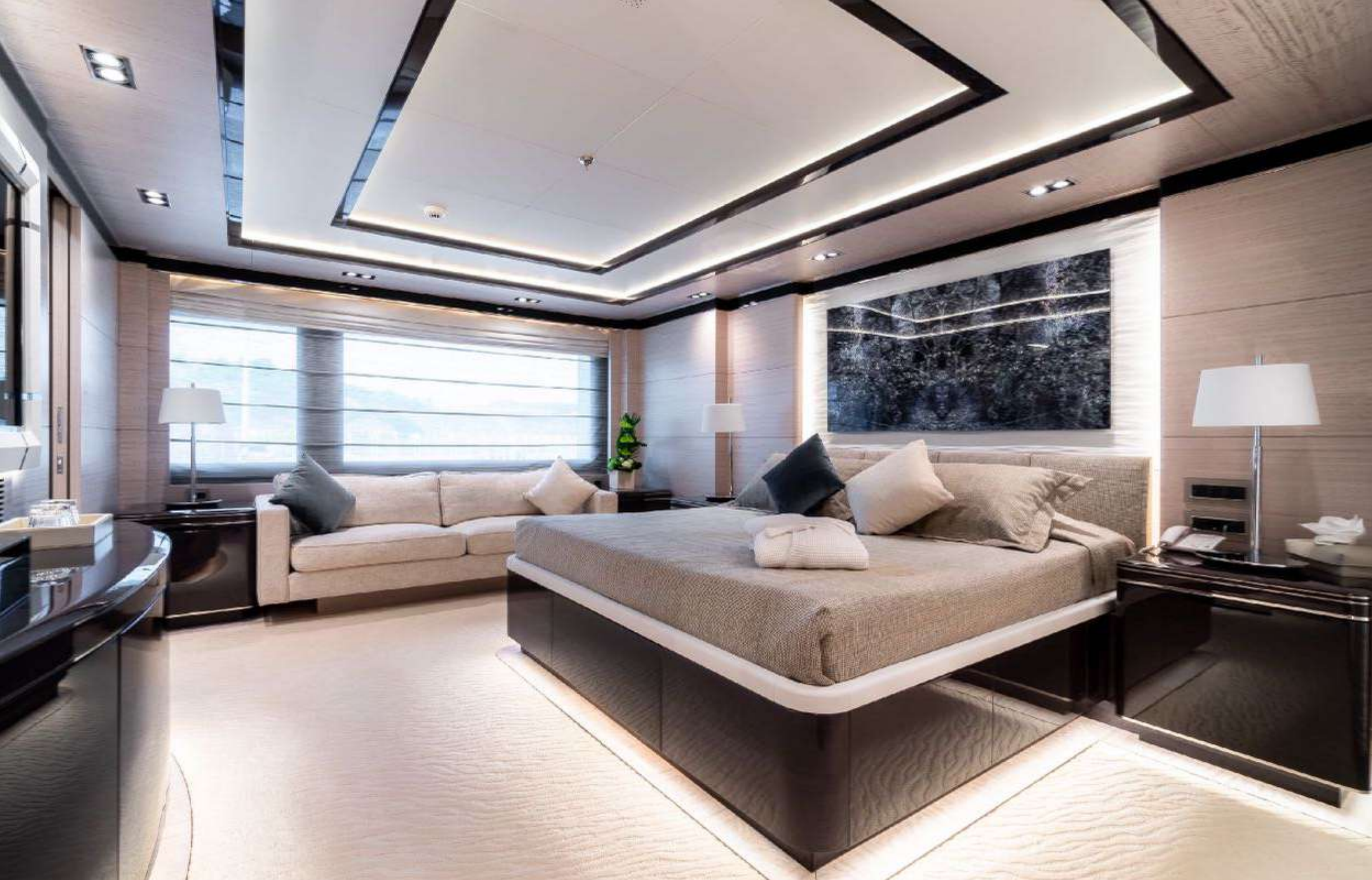
GUEST CABIN 2