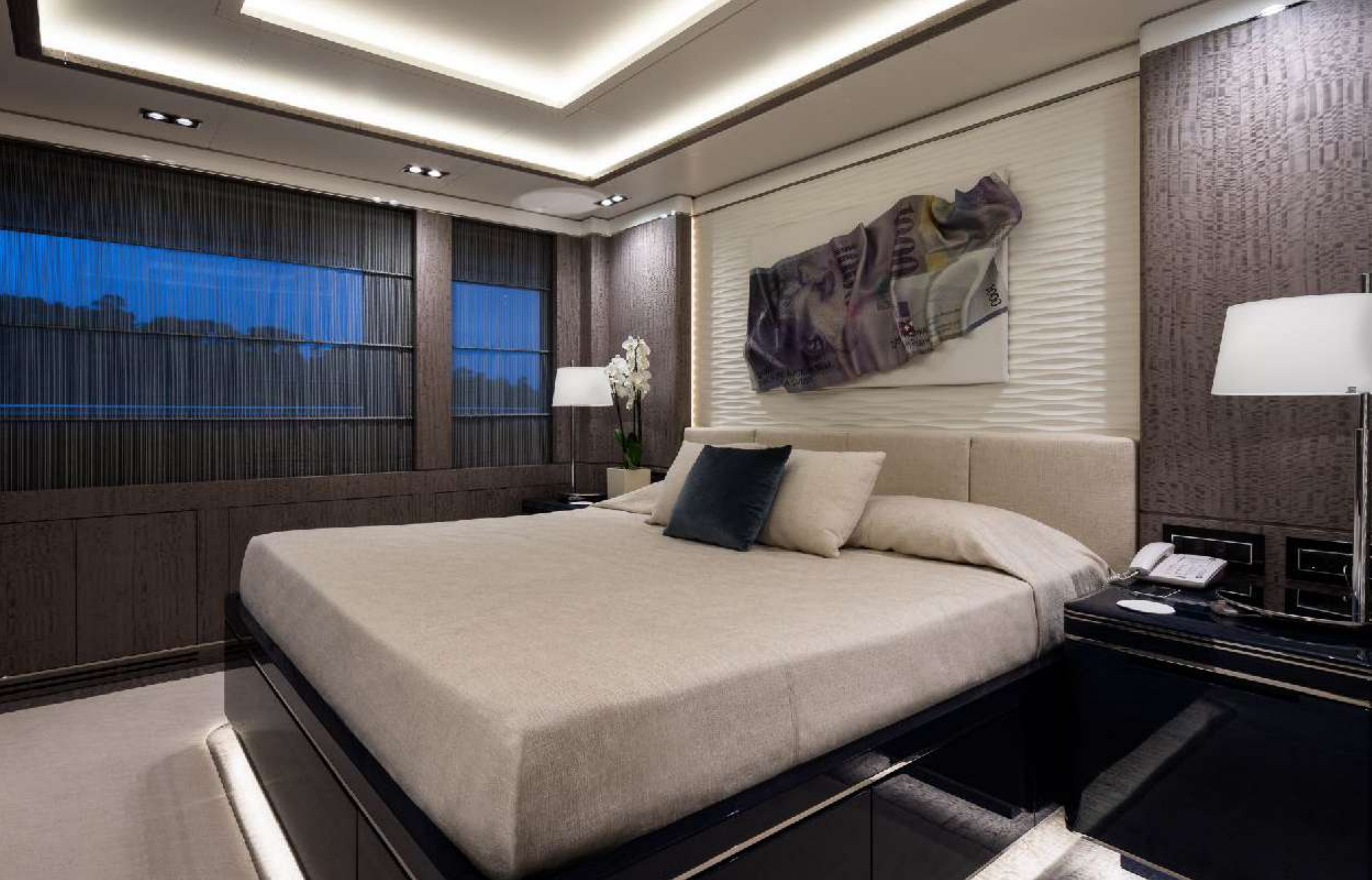
GUEST CABIN 8