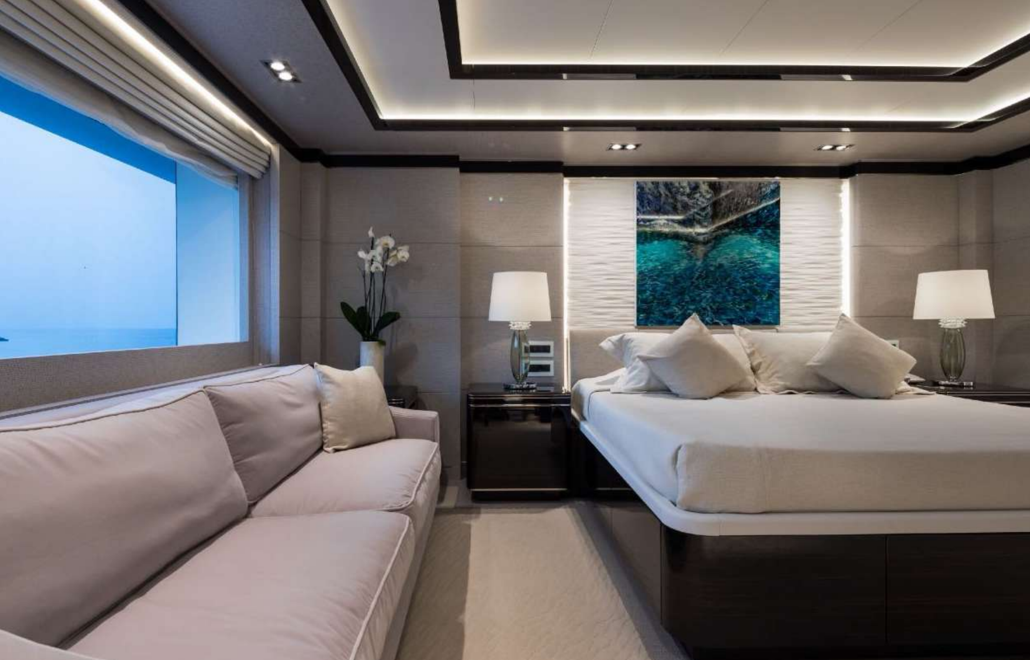
GUEST CABIN 4