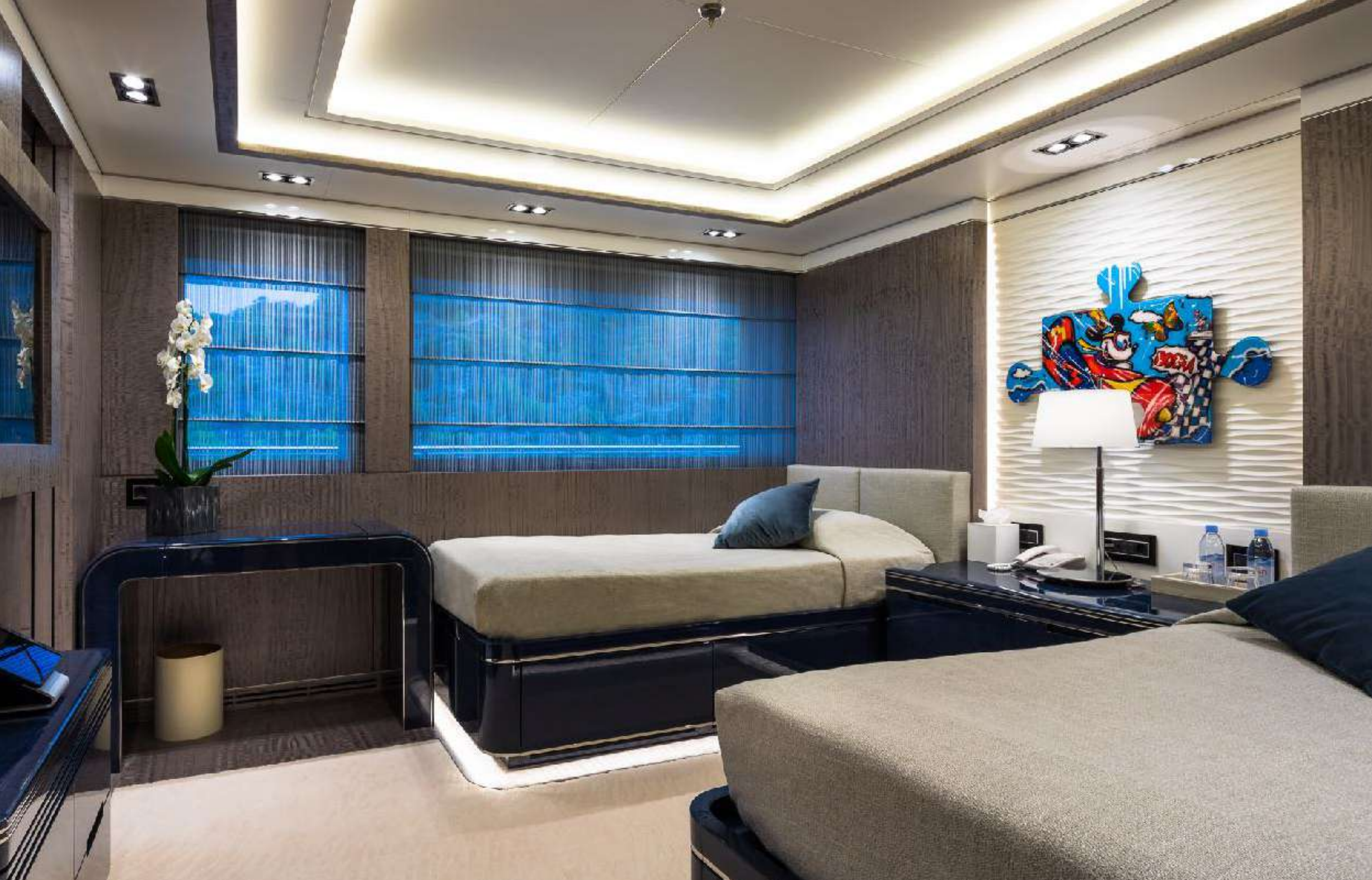
GUEST CABIN 6