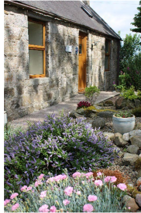
Slight incline up to front door