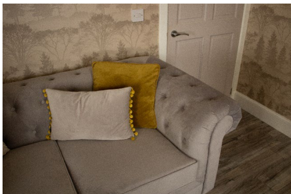
Colour contrasting door frames throughout