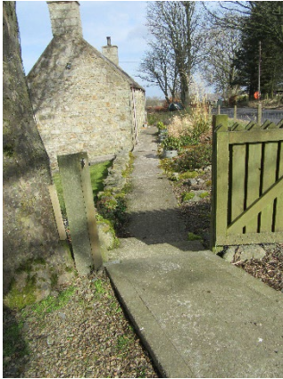
Access 3 steps down