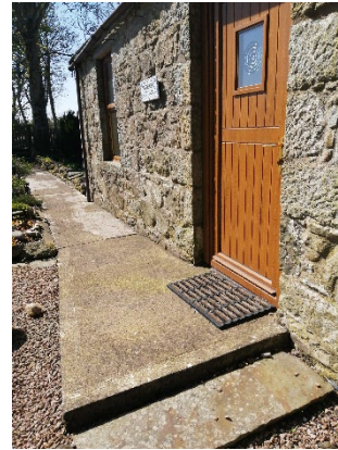
Path to Cottage entrance