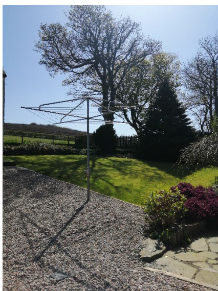
Lower end of the garden and patio

From the main garden to the terrace there is grass, gravel and 1 step to the patio area. Here there is a picnic bench. The table is 700mm high from floor to table edge. The bench seating height is 480mm. These are fixed seats with access points at either end.