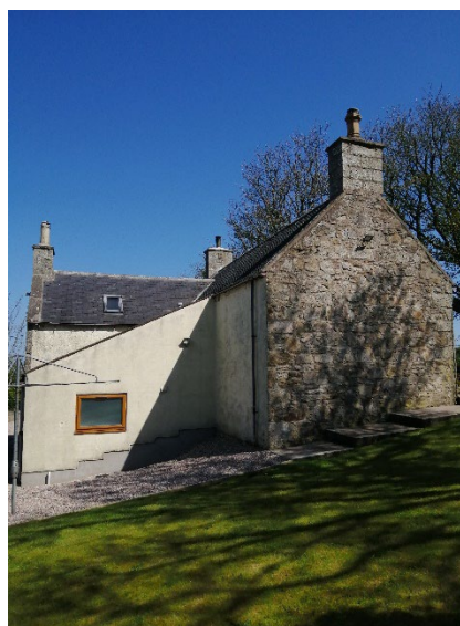
Steps down to the garden and gravel