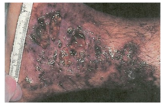
Figure 10-F Pyoderma Granulosum

Common characteristics of all PG lesions are that the wound margins are ragged, elevated, and violaceous (purple in color). Ulcers are exudative and extremely tender, the wound edges are often undermined. A band of erythema may extend from the wound edge, which defines the directions in which the ulcer will extend. Healing may occur along one edge of the wound while enlargement of wound occurs on the opposite edge. Ulcers heal very slowly and leave atrophic, irregular scars.