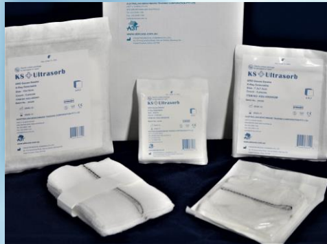
KS GAUZE Products