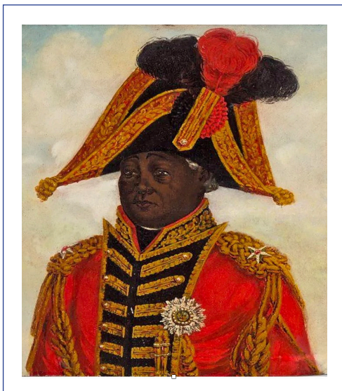
King Henry I

King Henry the first is a most maligned ancestor whose legacy deserves more scrutiny and attention than the nearly exclusive focus on his tyrannical rule. As a man with lofty and admirable aspirations, he was known to value excellence, intelligence, education, honesty, hard work, creativity, self-sufficiency, morality, prestige and to contemplate a vision of a wealthy, self-sufficient and prosperous Haiti. With his death in 1820, the goal of a dignified and thriving Haiti in the court of nations was thwarted and converted into a dream searching for a sliver of hope in a people who refuses to allow despair to take hold of their souls. Instead of a blooming and prosperous nation, we can hardly feed ourselves and, moreover, have surrendered to lawlessness to the point that it has become fashionable to use the idiotic expression "legal bandits" to describe our so called leaders. Perhaps a look back in time may help us find and stabilize our bearing again.