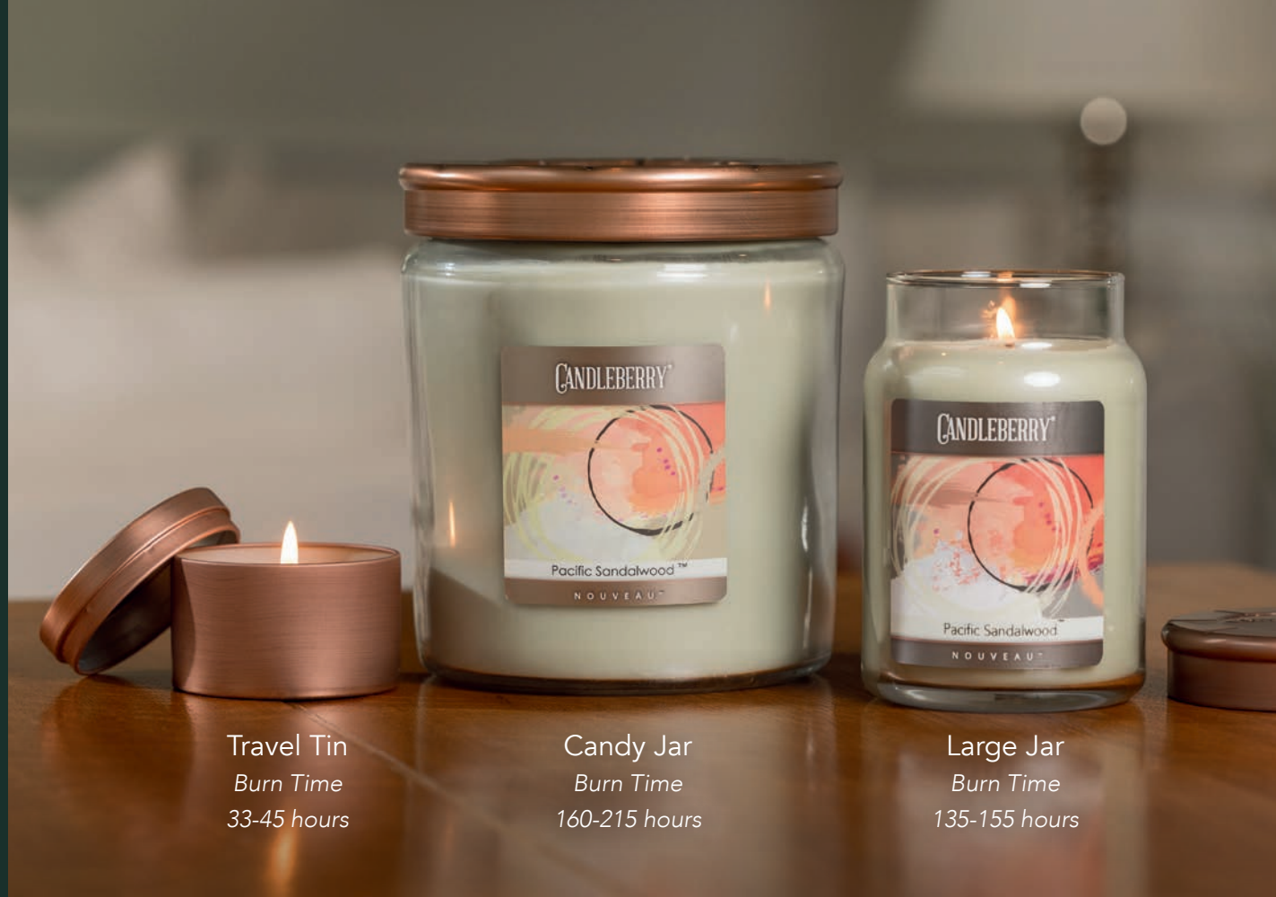
Travel Tin Burn Time 33-45 hours