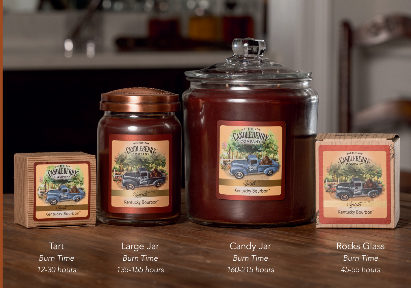
Tart Burn Time 12-30 hours