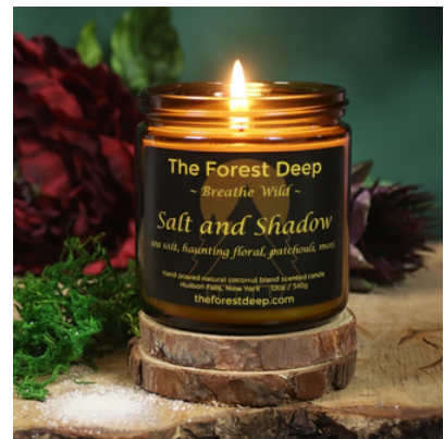
Salt and Shadow Coastal Woodlands Vibe

Notes: Sea Salt, Labdanum, Freesia, Grass, Patchouli, Cedar