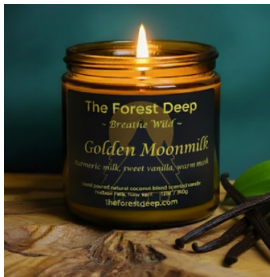
Golden Moonmilk Wild Harvest Vibe

Notes: Bergamot, Lemon, Milk, Lavender, Cardamon, Vanilla, Tonka Bean, Musk