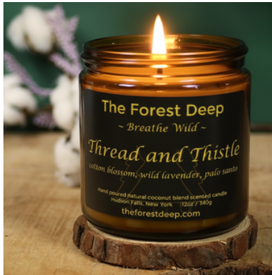
Thread and Thistle Woodland Folk Vibe

Notes: Cotton Blossom, Sage, Lavender, Patchouli, Amber, Palo Santo