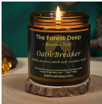
Oath Breaker Forest Rituals Vibe

Notes: Incense, Smoke, Oud, Amber, Musk, Leather