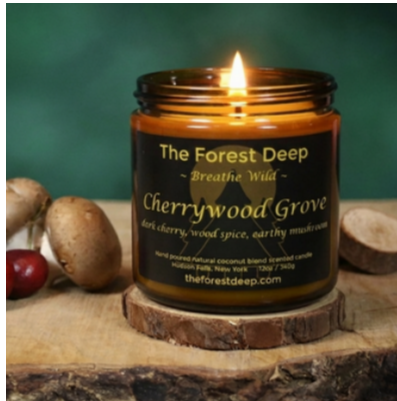
Cherrywood Grove Deepwood Vibe

A collection of forest-inspired scents that wander through moss, herbs, smoke, and wild harvests...capturing the many moods of the deep woods.