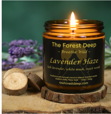
Lavender Haze Wildgrove Vibe

Notes: English Lavender, Jasmine, Moonflower, White Musk, Sweet Woods