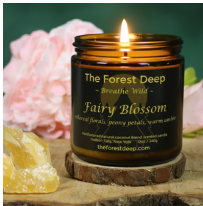
Fairy Blossom Woodland Folk Vibe

Notes: Freesia, Red Currant, Peony Petals, Tonka, Amber, Musk