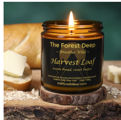
Harvest Loaf Wild Harvest Vibe