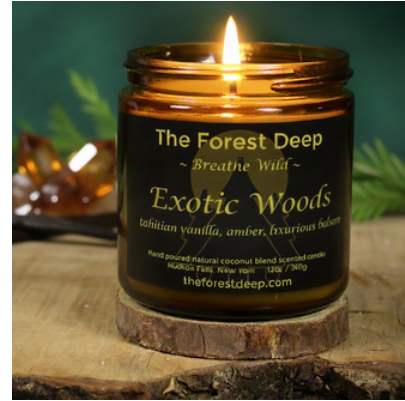
Exotic Woods Wildgrove Vibe

Notes: Leather, Exotic Vanilla, Warm Patchouli, Amber, Balsam Woods