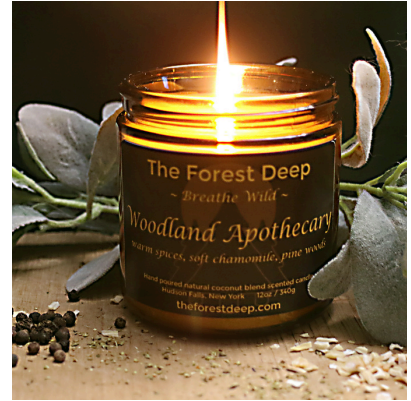
Woodland Apothecary Forest Rituals Vibe

Notes: Peppercorn, Sage, Moss, Patchouli, Chamomile, Coriander, Balsam