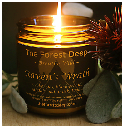
Raven's Wrath Forest Rituals Vibe

Notes: Green Balsam, Red Berries, Orchid, Sandalwood, Musk, Incense, Tonka