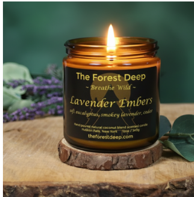
Lavender Embers Forest Rituals Vibe

Notes: Eucalyptus, Wild Lavender, Sage, Smoke, Patchouli, Cedar