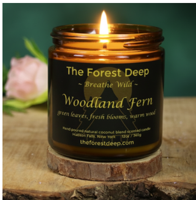
Woodland Fern Wildgrove Vibe

Notes: Bergamot, Mandarin Leaf, Fig, Jasmine, Lily, Musk, Sweet Woods