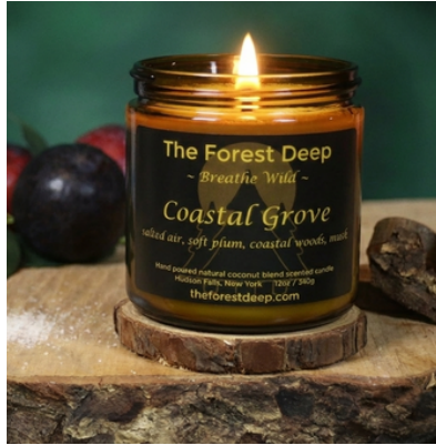
Coastal Grove Coastal Woodland Vibe

Notes: Sea Salt, Ozone, Plum, Eucalyptus, Sandalwood, Dark Musk