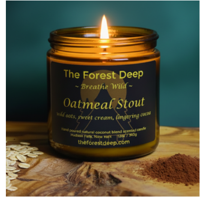
Oatmeal Stout Wild Harvest Vibe

Notes: Oatmeal Stout, Cream, Butter, Hint of Cocoa