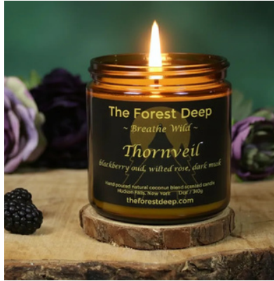
Thornveil Forest Lore Vibe

Notes: Oud, Blackberry, Rose, Myrrh, Dark Musk, Amber