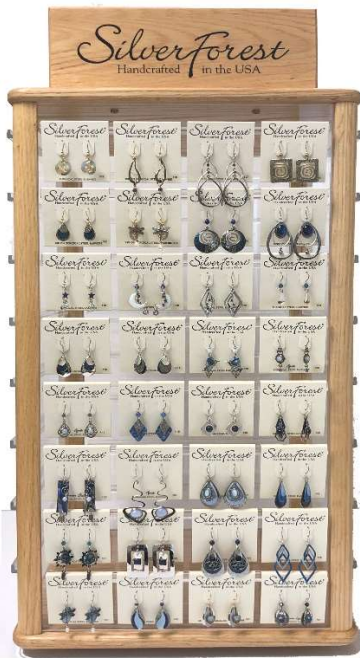
D-7 4 sided