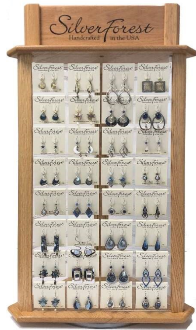
D-5 3 sided