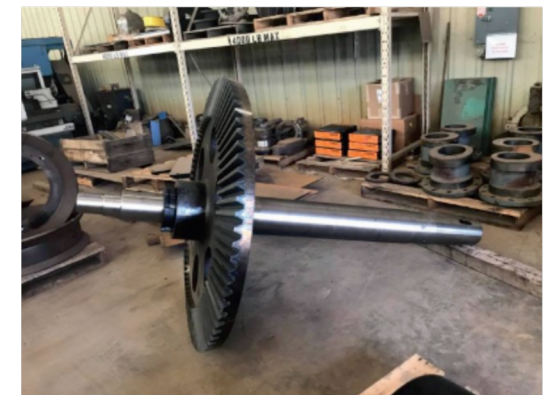
RAYMOND MILL BULL GEAR REPAIRED FABRICATED & HOBBED