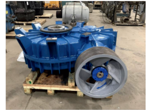
B&P 100B GEARBOX REPAIRED