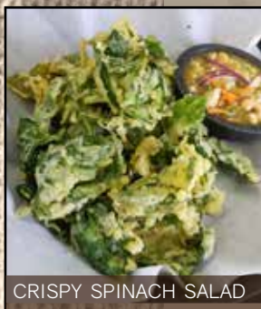
CRISPY SPINACH SALAD

Sliced NY steak tossed in homemade spicy lime dressing with rice powder, red onions, green onions, cilantro, fresh basil leaves, served on a bed of romaine