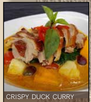
CRISPY DUCK CURRY