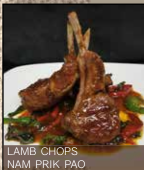
LAMB CHOPS NAM PRIK PAO