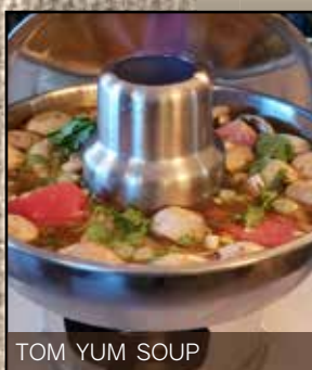
TOM YUM SOUP

Choice of meat in lemongrass, lime leaves and galangal broth, mushrooms, coconut milk and lime juice