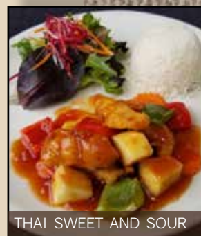
THAI SWEET AND SOUR