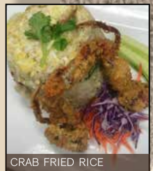
CRAB FRIED RICE

Jasmine rice, stir-fried with carrots, peas, onions, green onions, egg, pineapple, cashews, and curry powder