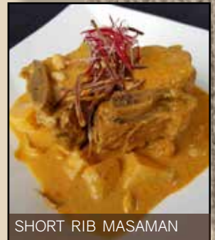
SHORT RIB MASAMAN