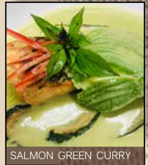
SALMON GREEN CURRY

Fresh red curry paste in coconut milk with mangoes, pineapples, grapes, and tomatoes with fresh basil topped with sliced crispy duck breast