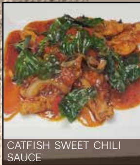
CATFISH SWEET CHILI SAUCE

CATFISH SWEET CHILI SAUCE 🌶️ ..... $17.95