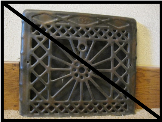
1. Hot air registers—dry, heated air blowing directly on the back of a piano is particularly bad for the soundboard.

Environment: While tuning, repairs, regulation and voicing are the job of the technician, seeing to it that your console piano is placed in an appropriate spot within your home is up to you. What is needed, as much as possible, is a location where temperature and humidity are kept at moderate levels year-round. Drafty locations, or areas where wide swings in either temperature or humidity occur (for example, unheated porches, moldy basements, etc.) are unsuitable for any piano. In particular, avoid placing your piano in front of either of the following: