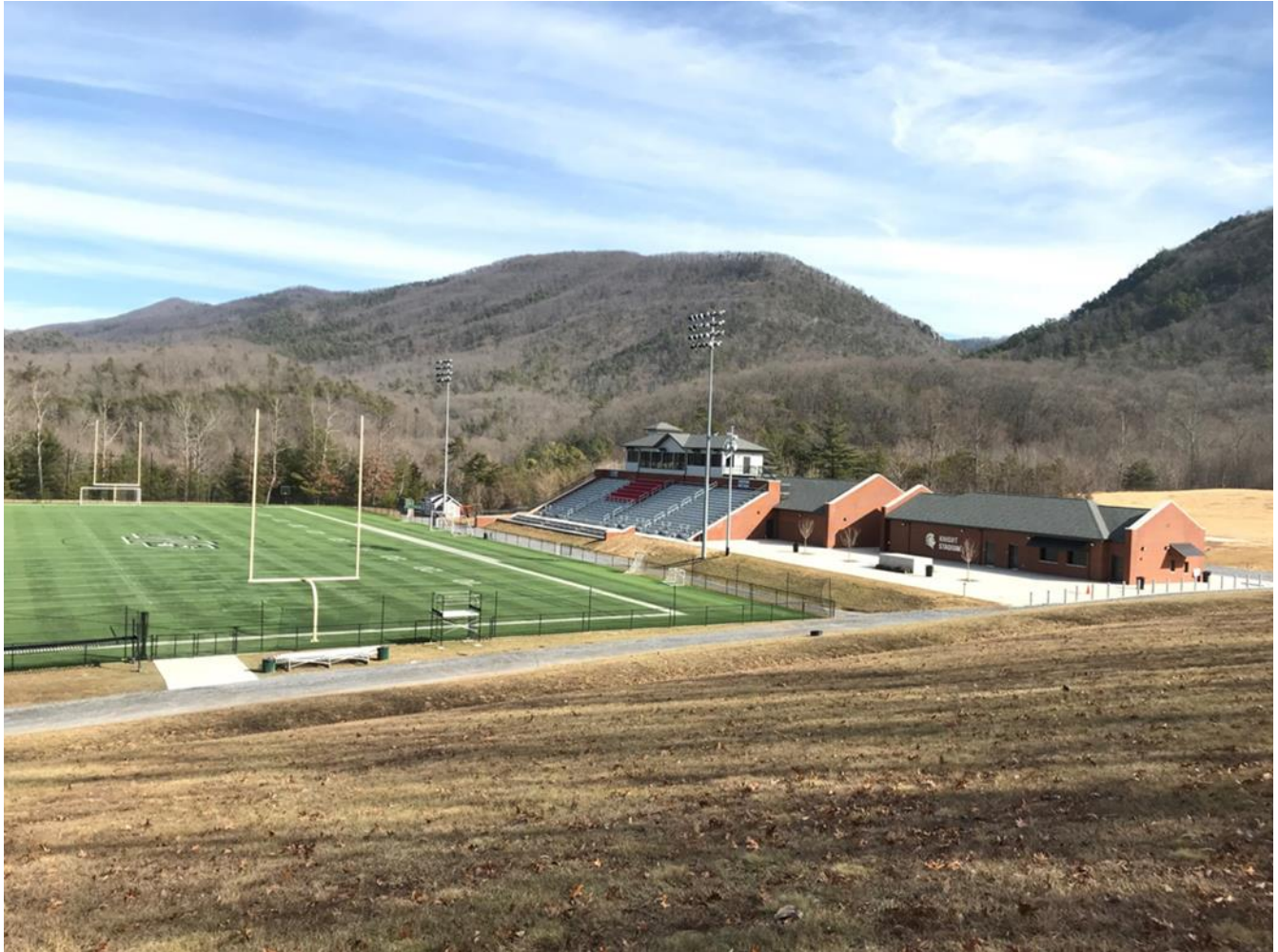
Artificial Turf Field (2008) and Stadium with Locker Rooms and Concessions (2017)