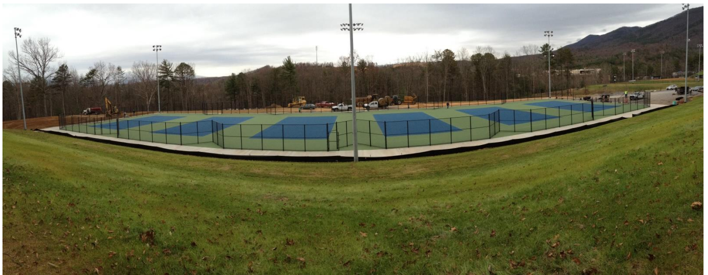
Tennis Courts under construction in 2013