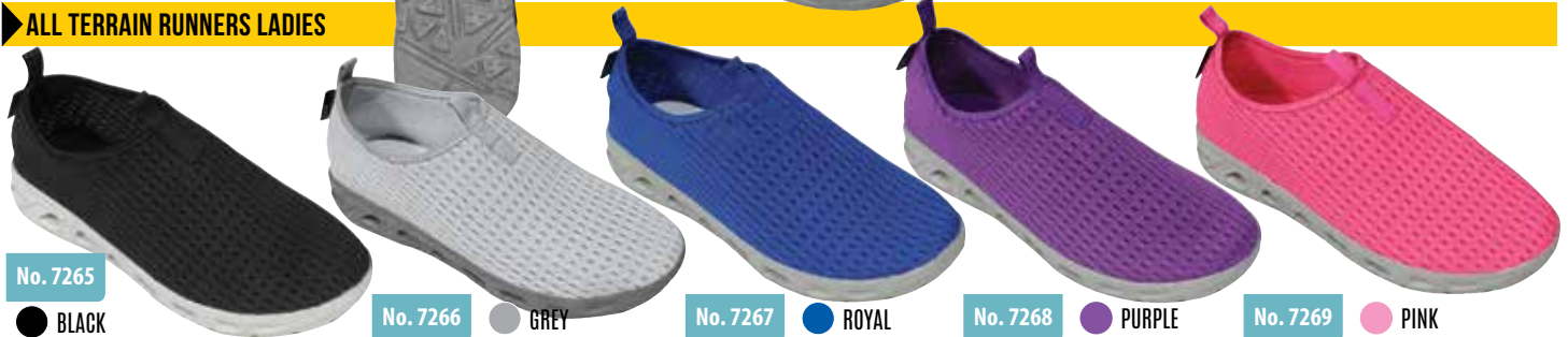
No. 7265 ● BLACK