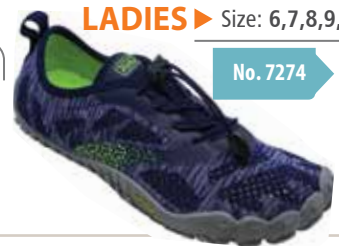
No. 7274 ● NAVY