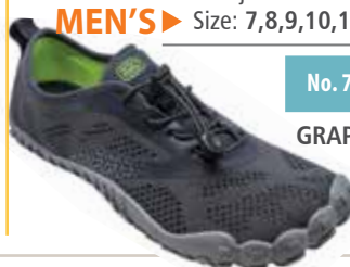
No. 7270 ● GRAPHITE