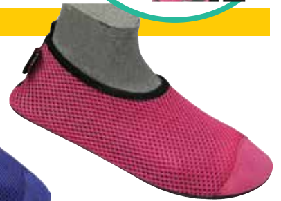
No. 7206 ● MAGENTA