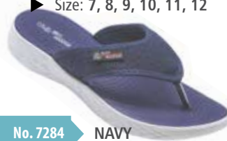
No. 7284 ● NAVY