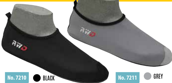
No. 7210 ● BLACK