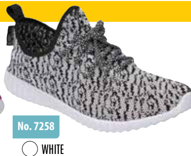
No. 7258 ○ WHITE