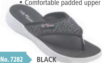
No. 7282 ● BLACK