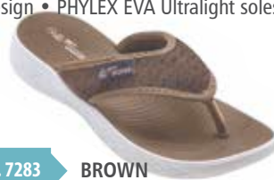
No. 7283 ● BROWN