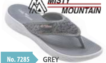
No. 7285 ● GREY