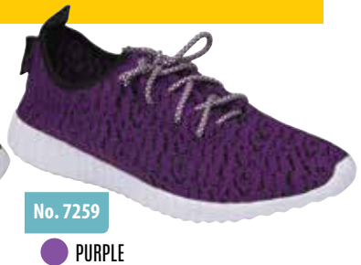
No. 7259 ● PURPLE