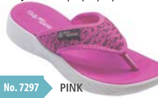
No. 7297 ● PINK