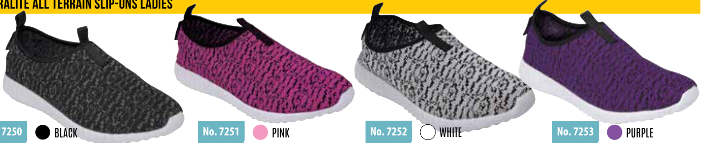
No. 7250 ● BLACK