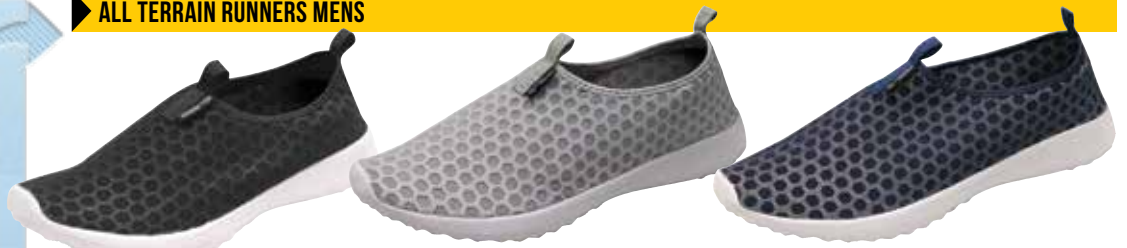
No. 7231 ● BLACK