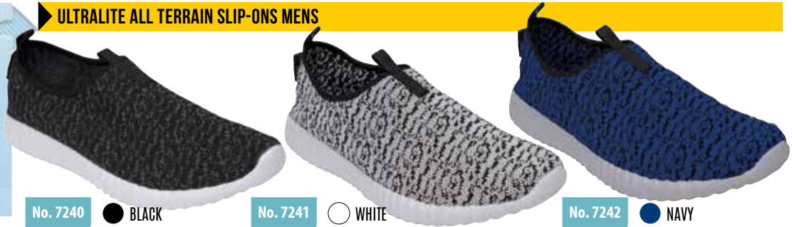
No. 7240 ● BLACK