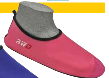
No. 7213 ● MAGENTA