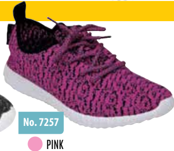
No. 7257 ● PINK