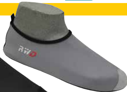
No. 7211 ● GREY