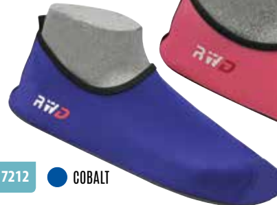
No. 7212 ● COBALT