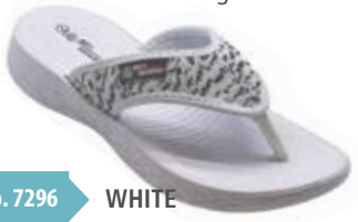
No. 7296 ● WHITE