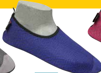
No. 7205 ● COBALT