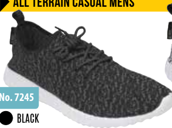
No. 7245 ● BLACK