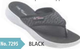
No. 7295 ● BLACK