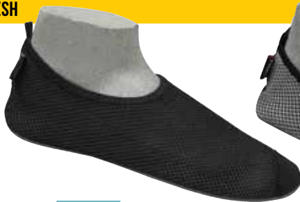
No. 7203 ● BLACK