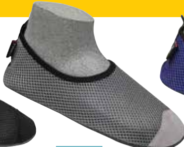
No. 7204 ● GREY