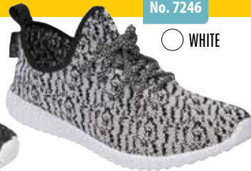
No. 7246 ○ WHITE