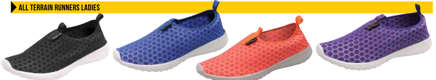
No. 7235 ● BLACK