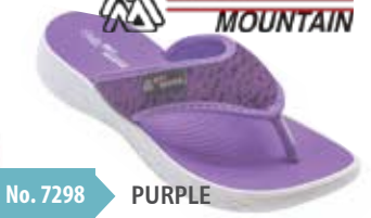
No. 7298 ● PURPLE