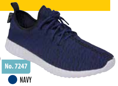
No. 7247 ● NAVY