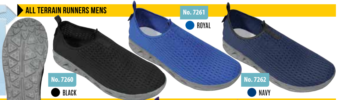
No. 7260 ● BLACK