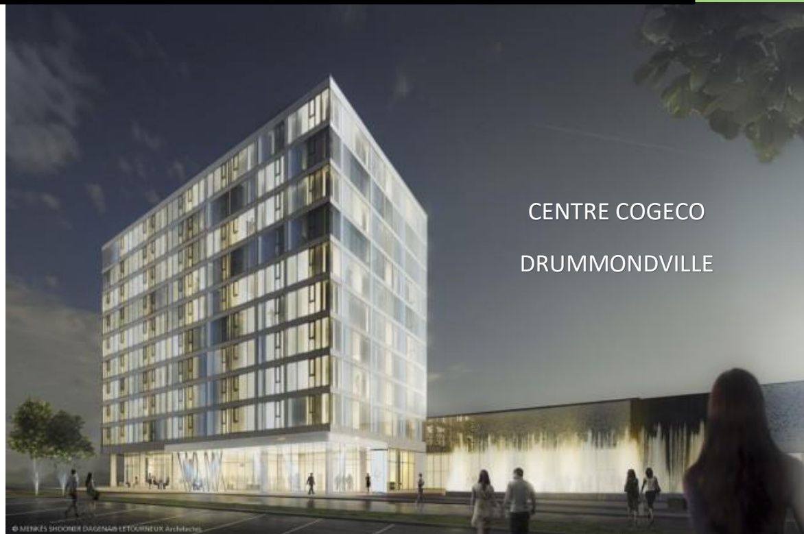
CENTRE COGECO DRUMMONDVILLE