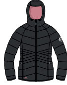
DARK GREY DUSTY ROSE

Technical Specification Ultra Lightweight Jacket Grown on Hood 2 Lower Zipped Pocket Front Zipper with Contrast Teeth Detail Matching Binding at Cuffs & Hem Contrasting Lining Badge Detail on Sleeve Stuff Sack in Pocket