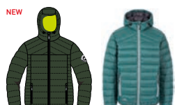
IVY LIME ZEST