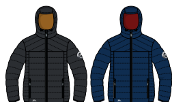
DARK GREY SANDSTONE