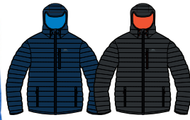
NAVY VIBRANT BLUE