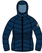
NAVY DENIM BLUE