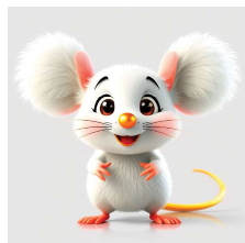
A. Nonny Mouse (Magical)

At that instant, four shooting stars bumped together in a golden, magical POUF! The magic gave A. Nonny a golden nose, a golden magical tail and – flying high above him – a tiny Fairy Moon Mouse. She also had a golden nose and a golden magical tail.