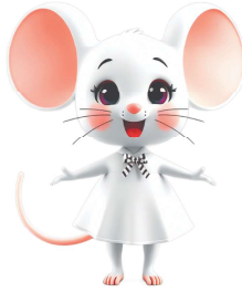
N. Dorr Mouse

“I think moonball is fun,” said N. Dorr as she took G. Teeny's paw in hers. “Let's go.”