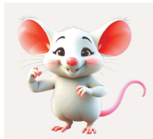
E. Norr Mouse

E. Norr moon mouse smoothed his tail and said, “We played rock tag. I want to play moonball now.”