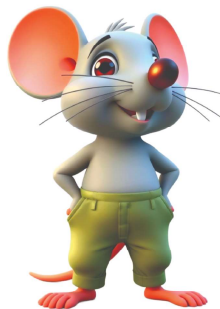
O. Cheesy Mouse

O. Cheesy wiggled his moon mouse ears. Everyone laughed – except A. Nonny.