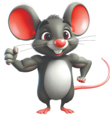
B. Infa Mouse

A. Nonny walked back and forth as he talked. “I wish, I wish,” he said, “I wish I could have anything I wish for.”