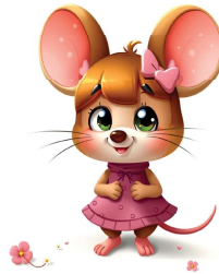
G. Teeny Mouse

“We'll see you later,” said G. Teeny, and the five moon mice disappeared behind a rock.