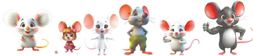
A. Nonny ---- G. Teeny ---- N. Dorr ---- O. Cheesy ---- E. Norr ---- B. Infa

Five little moon mice came to play with their friend, A. Nonny . The girls were G. Teeny and N. Dorr . The boys were O. Cheesy , E. Norr , and B. Infa .