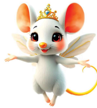
Fairy Moon Mouse

Fairy Moon Mouse fluttered down in a swirl of sparkles. “Be careful what you wish for, A. Nonny,” she said.