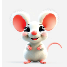
A. Nonny Mouse

A. Nonny shook his head. “I don’t want to go to B. Infa’s house. Let’s play rock tag instead.