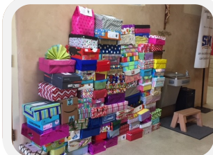
Families Helping Families