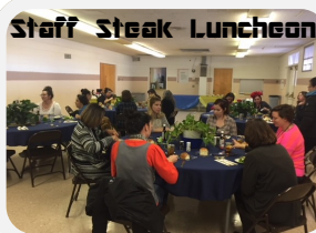
Staff Steak Luncheon

Thank you parents for all the help in making Catholic Schools Week 2019 a wonderful celebration of all the good things about Catholic education. Our parents rock!