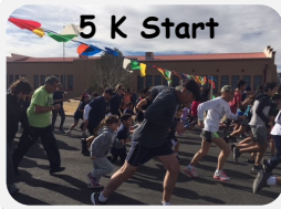
5 K Start

The St. Therese of Calcutta group at OLB serves soup to the indigent in our community on Fridays at the KC Hall.