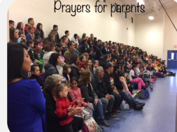
Prayers for parents