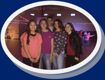
8th graders enjoying their last Valentines dance at St. Mary's.