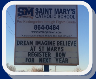
Time to register for 2019