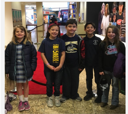
Third graders enjoying the museum.