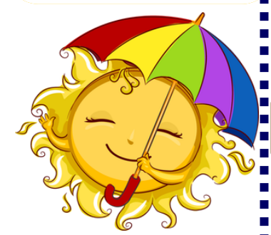
National Trachars Day May 8th National Education Wrrk, 7th-11th