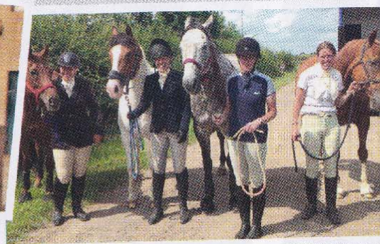
Far left— OBH teams. Then: the triumphant 1971 Quadrille team and Now: (left) one of the club's teams today