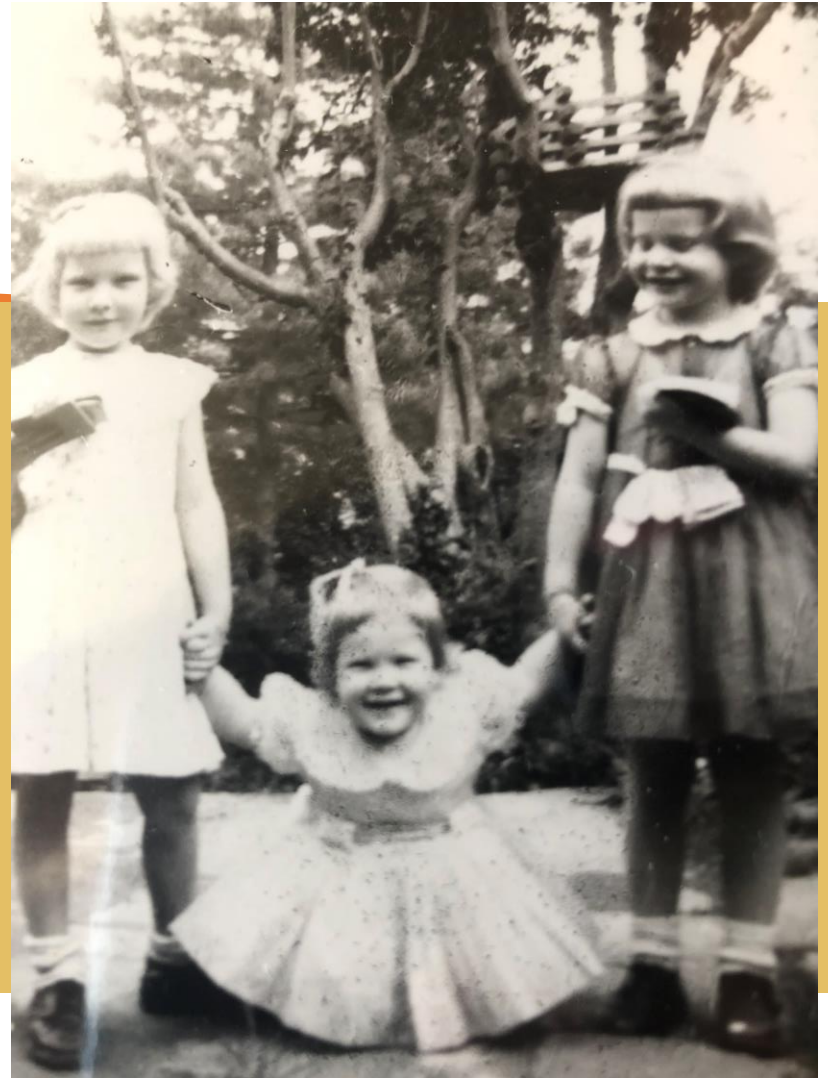
Three sisters who were all “cherubs” at one point in time