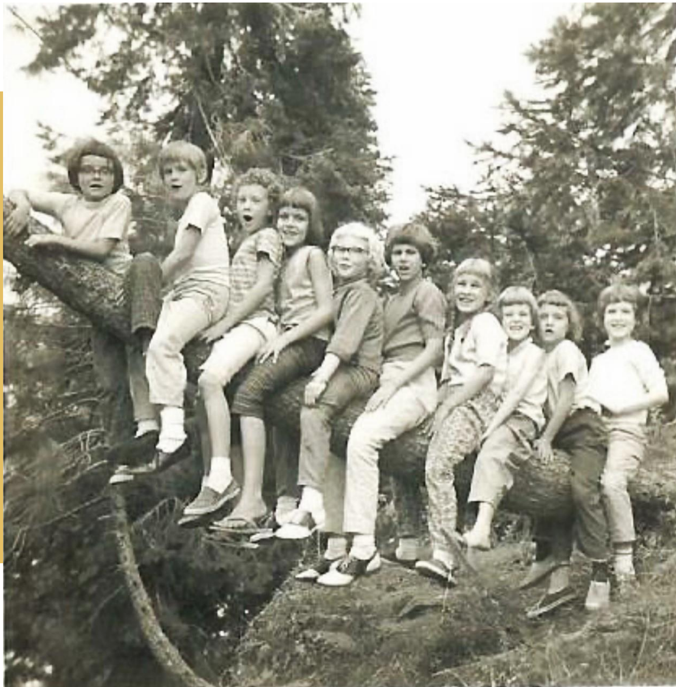
Auntie Eunice's "cherubs" in a tree at Sandes Home.