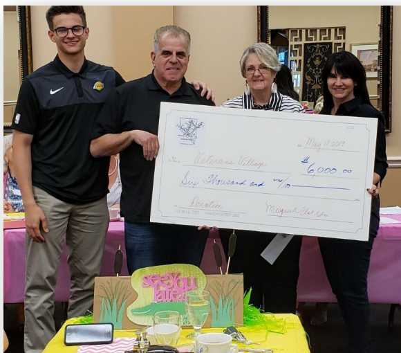
The BIG Check to Veterans Village!