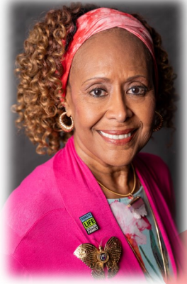
GFWC State President 2024-2026