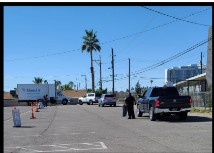
We had 105 cars come through.