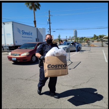
Over 75 pounds of prescription drugs turned in.