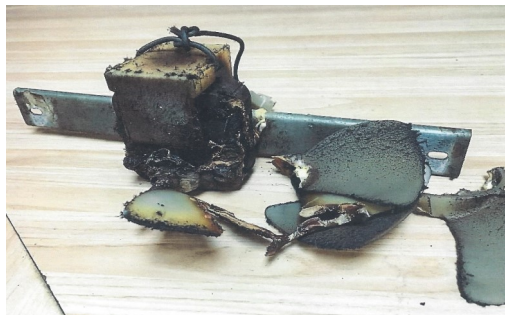
Old kitchen fan. YUCK! A fire hazard!