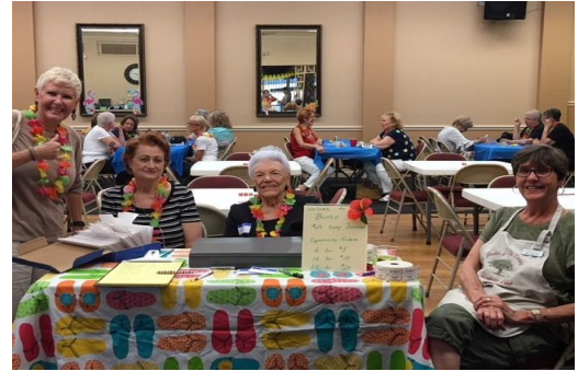
Welcome to the Ways & Means Fundraiser!