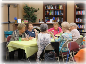
Fun at the Board Fundraiser!