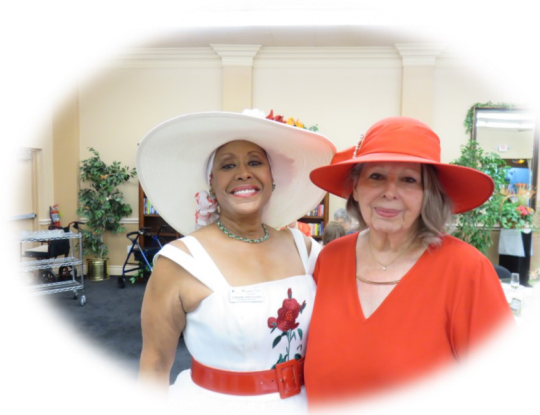
Two Presidents at the Garden Tea!