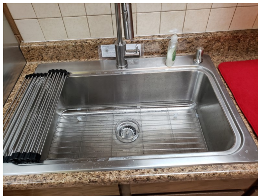
New extra-large kitchen sink.