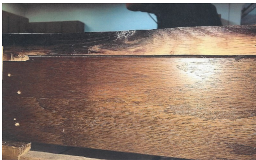
Charred counter under the old cooktop.

Because time was of the essence due to the fire-hazard issue and to try to get the work done before our busy club year started, our Building Committee met and agreed that since the labor for the project was free, the kitchen could have a little improvement to the countertops and sink as well. With input from our Executive Board, a decision was made to replace the very old cooktops with one new 5-burner cooktop ( see photo below. ) This change required replacing the countertop, and a deep one-basin sink was purchased to ease rinsing large items like our coffee and tea urns ( see photo below. ) It was also decided to replace the rest of the perimeter countertops and add a microwave shelf and new microwave oven. The Executive Board has voted to take an amount from the Celebration of Life fund, along with the $1,500 donated by the Craft Group, to complete the project. The maximum authorized to be spent is $3,500, but it appears the project may cost less than that. The new large countertop, hood fans, cooktop and sink have been installed. The rest of the project is in process and when completed will not only give our kitchen an updated look, but will make it a safer