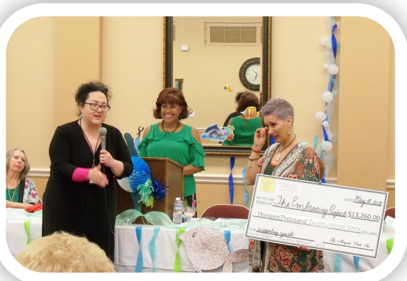
Closing Luncheon Pride! $13,260 to TEP!