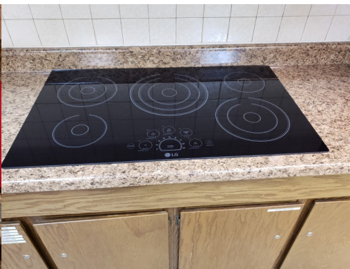
New five-burner cooktop.