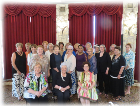
Thank you to these ladies for your hard work!