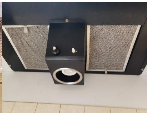
New exhaust fan.