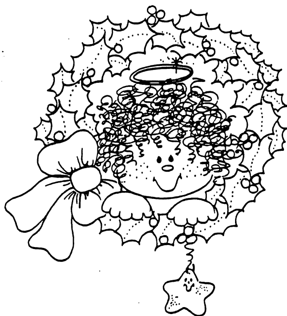
THE HEAVENLY ANGELS

The Ways and Means Committee Presents "COUNTRY CHRISTMAS" is "HOLIDAY HAPPINESS"