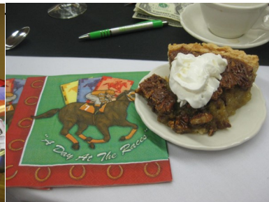
MM MM Good!