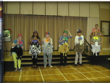
Our Lovely Horses