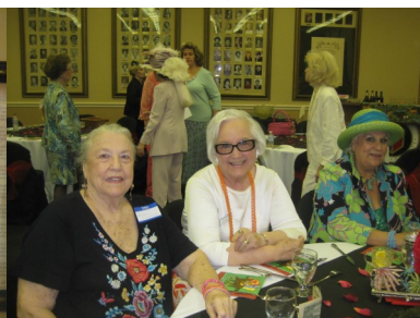
Waiting for the Race