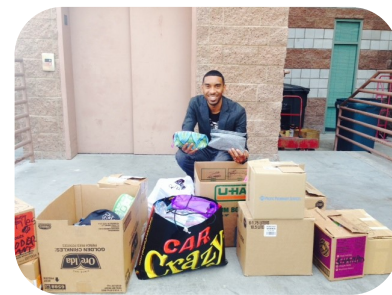
Beauty Bags Delivered