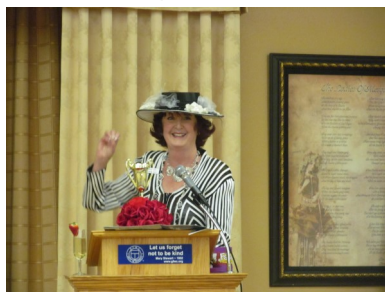
Place your Bets!