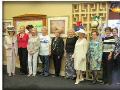
A Day at the Races