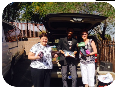
Beauty Bag Delivery