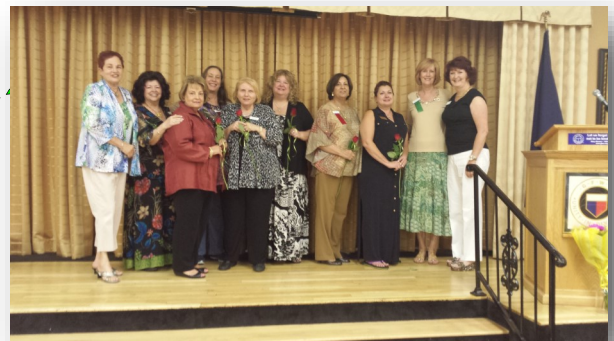
Evening New Members