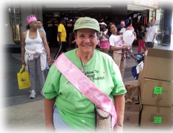
Melanoma Walk for a Cure