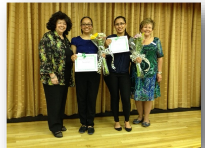
Evening Scholarship Award