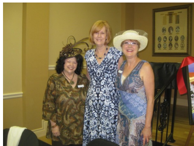
Evening Ladies at A Day Meeting