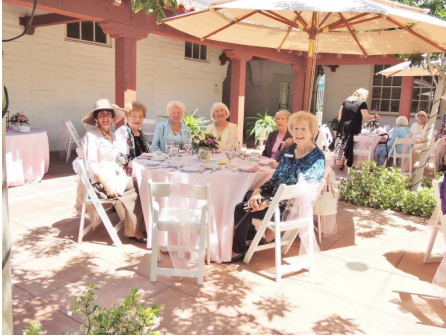
Garden Tea at The Historic Fifth Street School