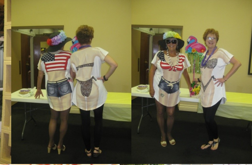
Evening Bunco Luau