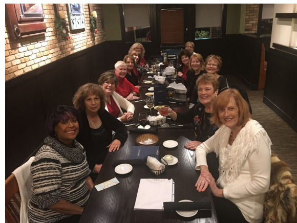
Evening Holiday Celebration at Carrabba's Italian Grill