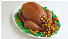
Thanksgiving Turkey Cake!