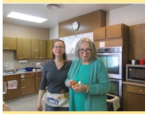
Caught you hiding in the kitchen.