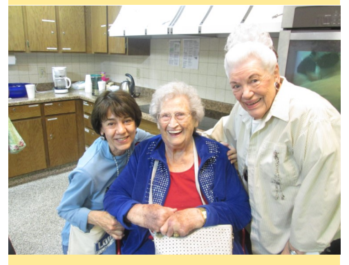
Our lovely workers!