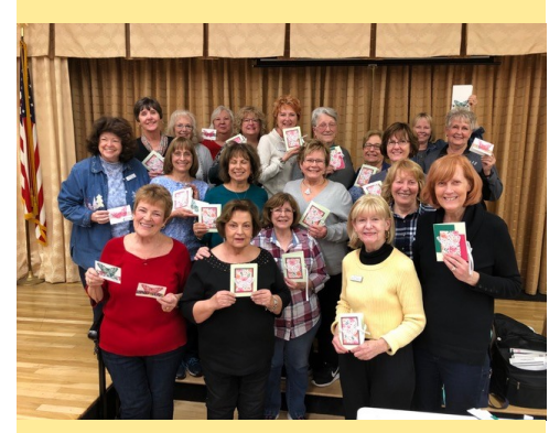
An evening of making beautiful cards!