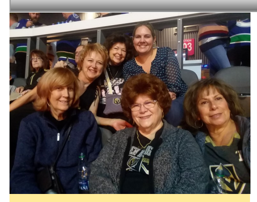
Go! Knights Go!