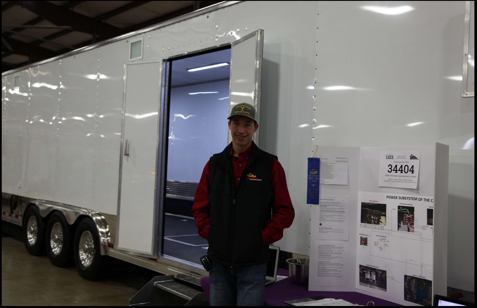
Class 1103 – Other Trailers and Semi Pulled Trailers