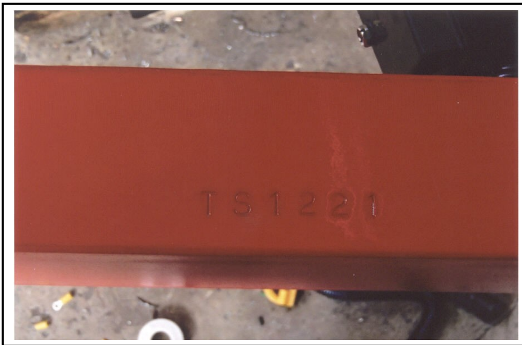
Identification (VIN) Number stamped on frame of trailer