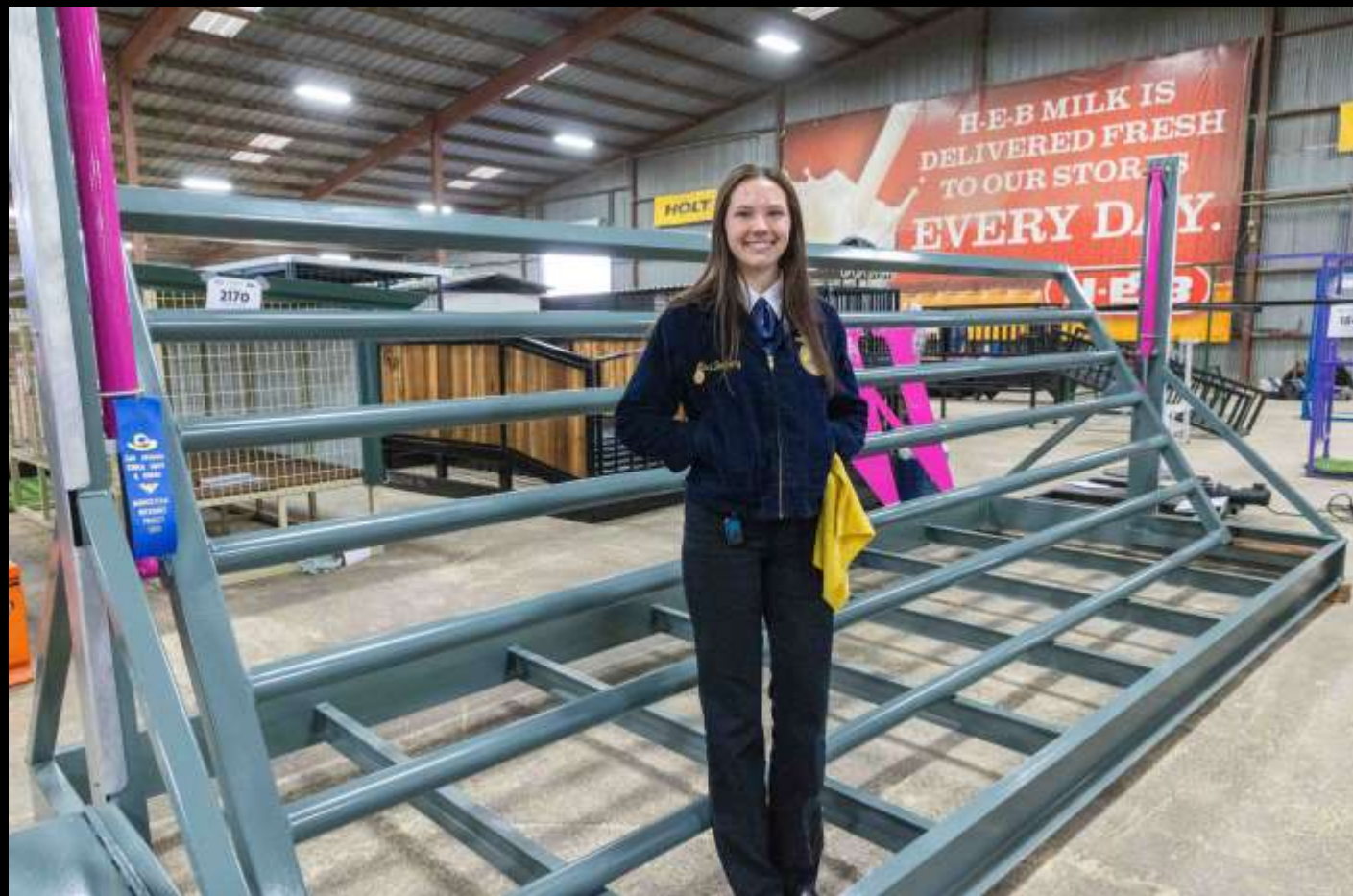
Class 703 – Other Livestock Equipment