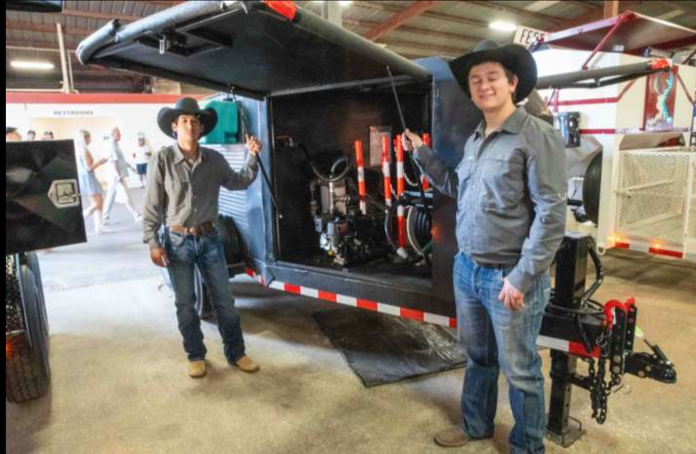
Class 904 – Other Bumper Pull