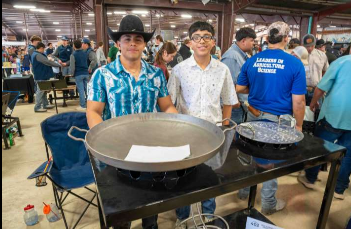
Class 403 – Fish Fryers, Disk Cookers