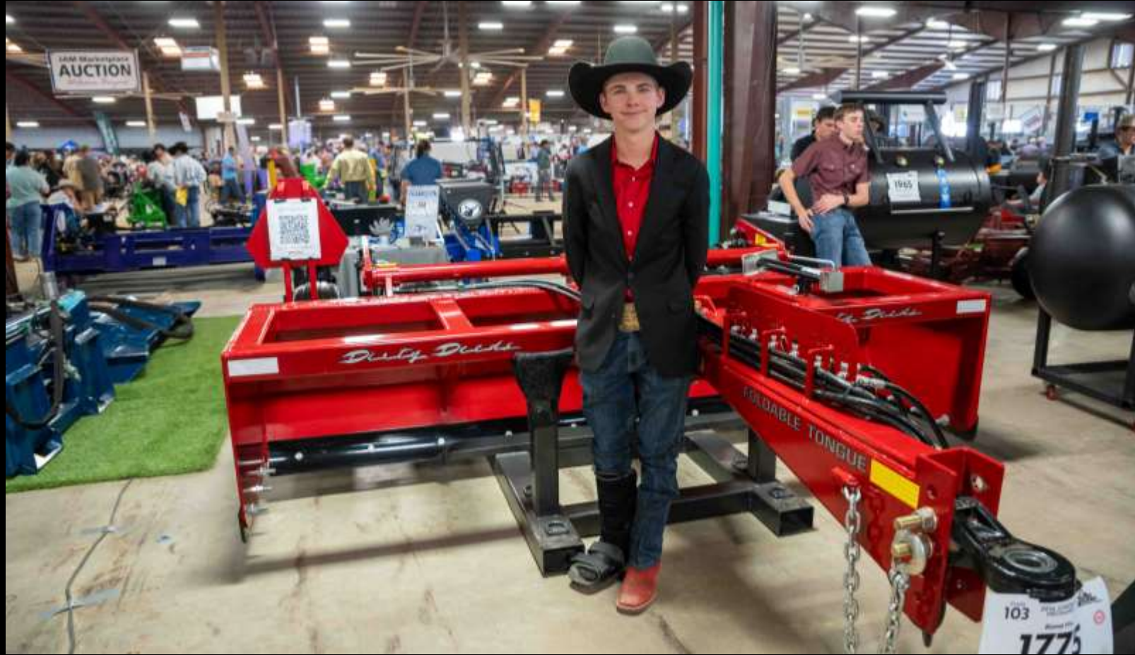
Class 103 – Tractor Equipment