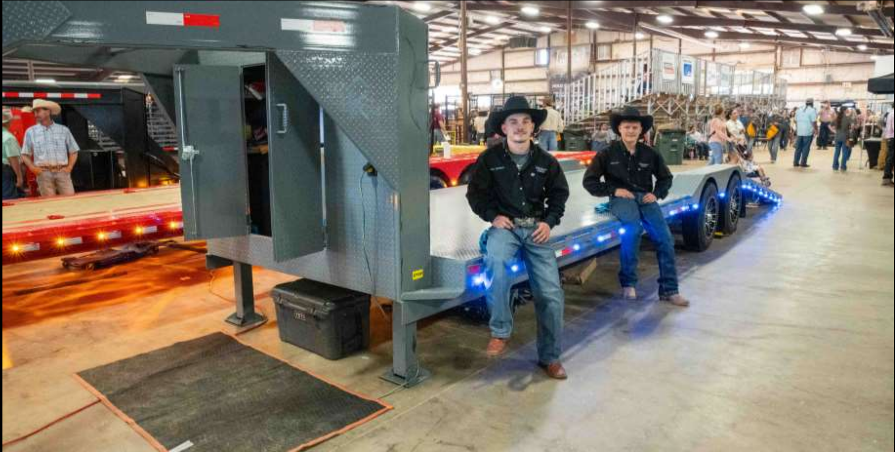
Class 1001 – Lowboy