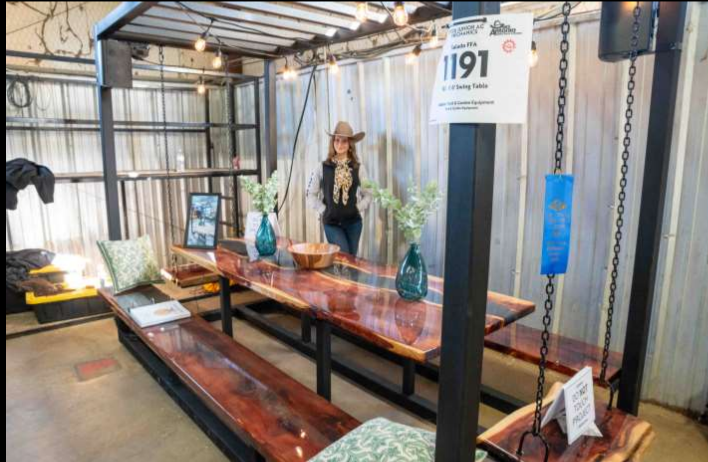
Class 502 – Outdoor Yard & Garden Equipment