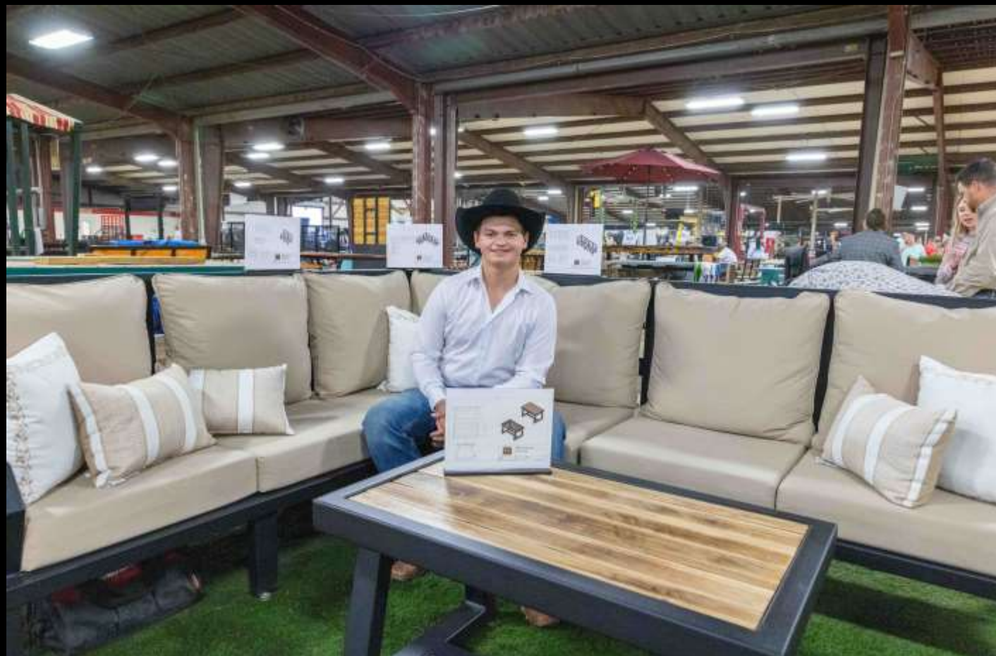
Class 501 – Patio or Yard Tables and Benches