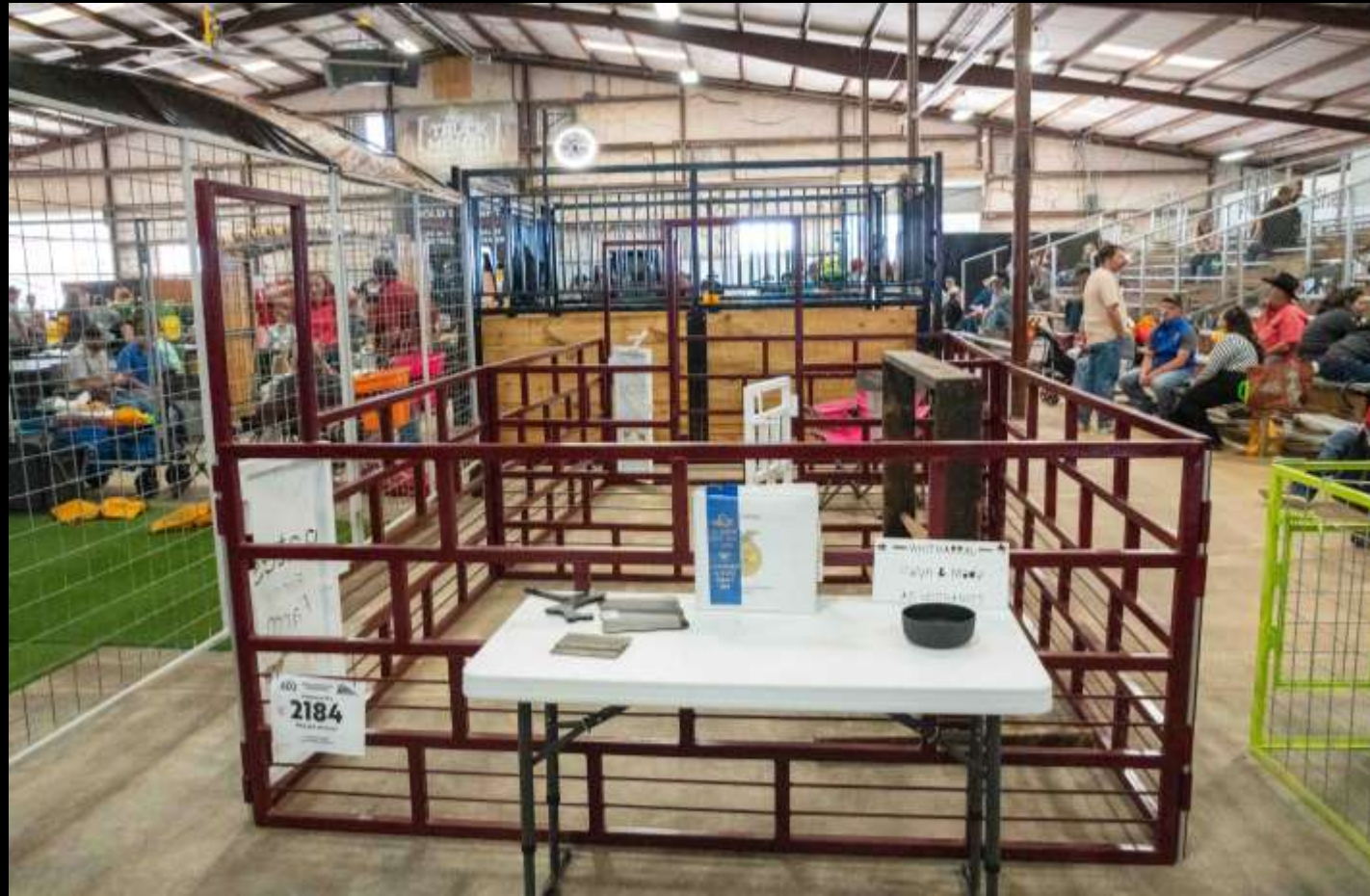
Class 602 – Livestock Panels