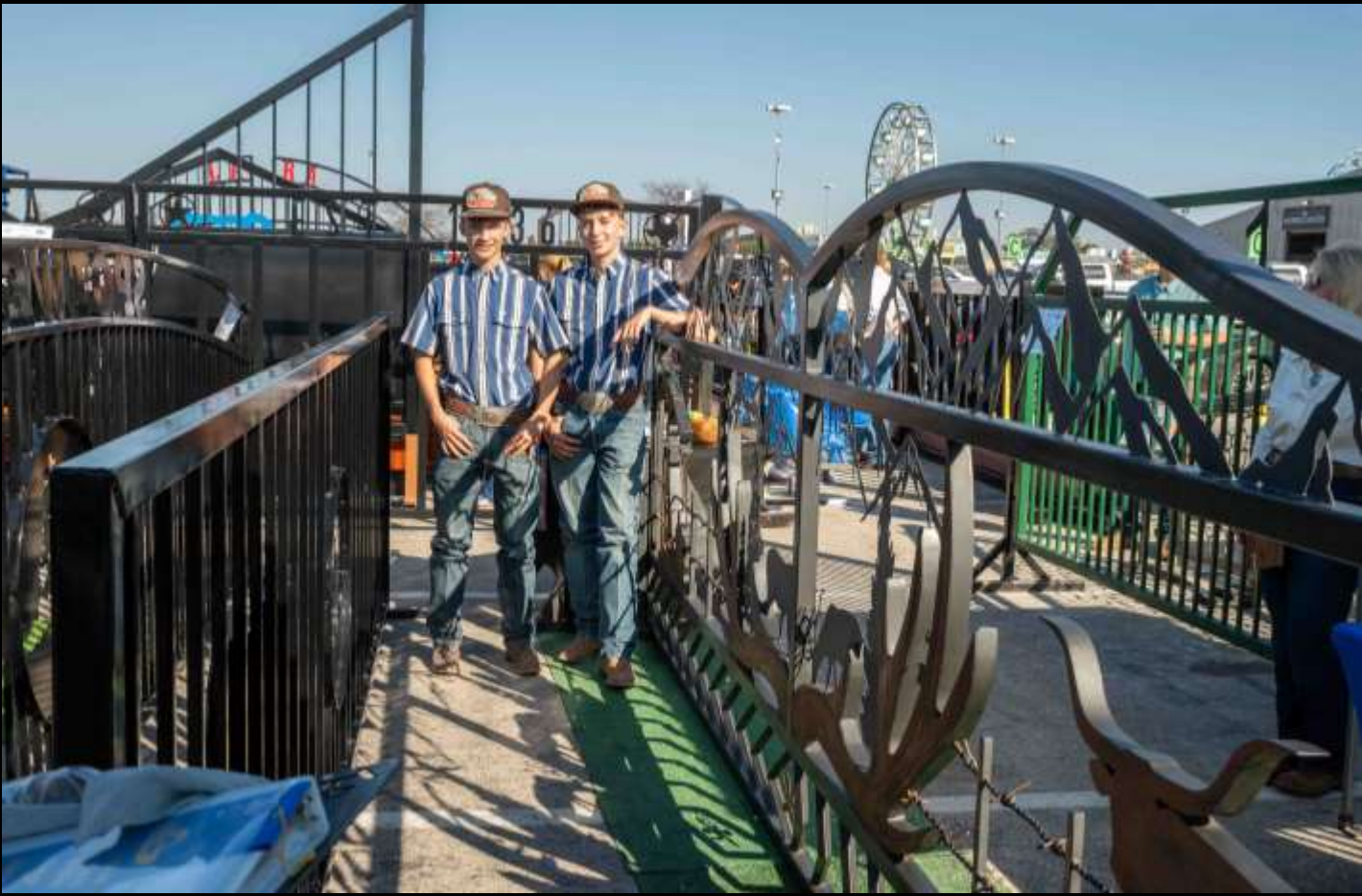
Class 601 - Gates