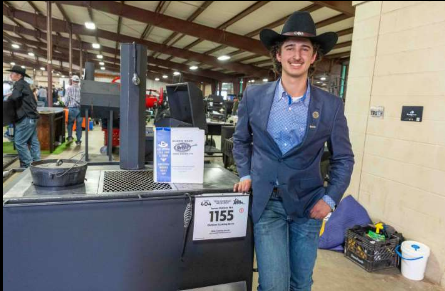
Class 404 – Other Cooking Devices