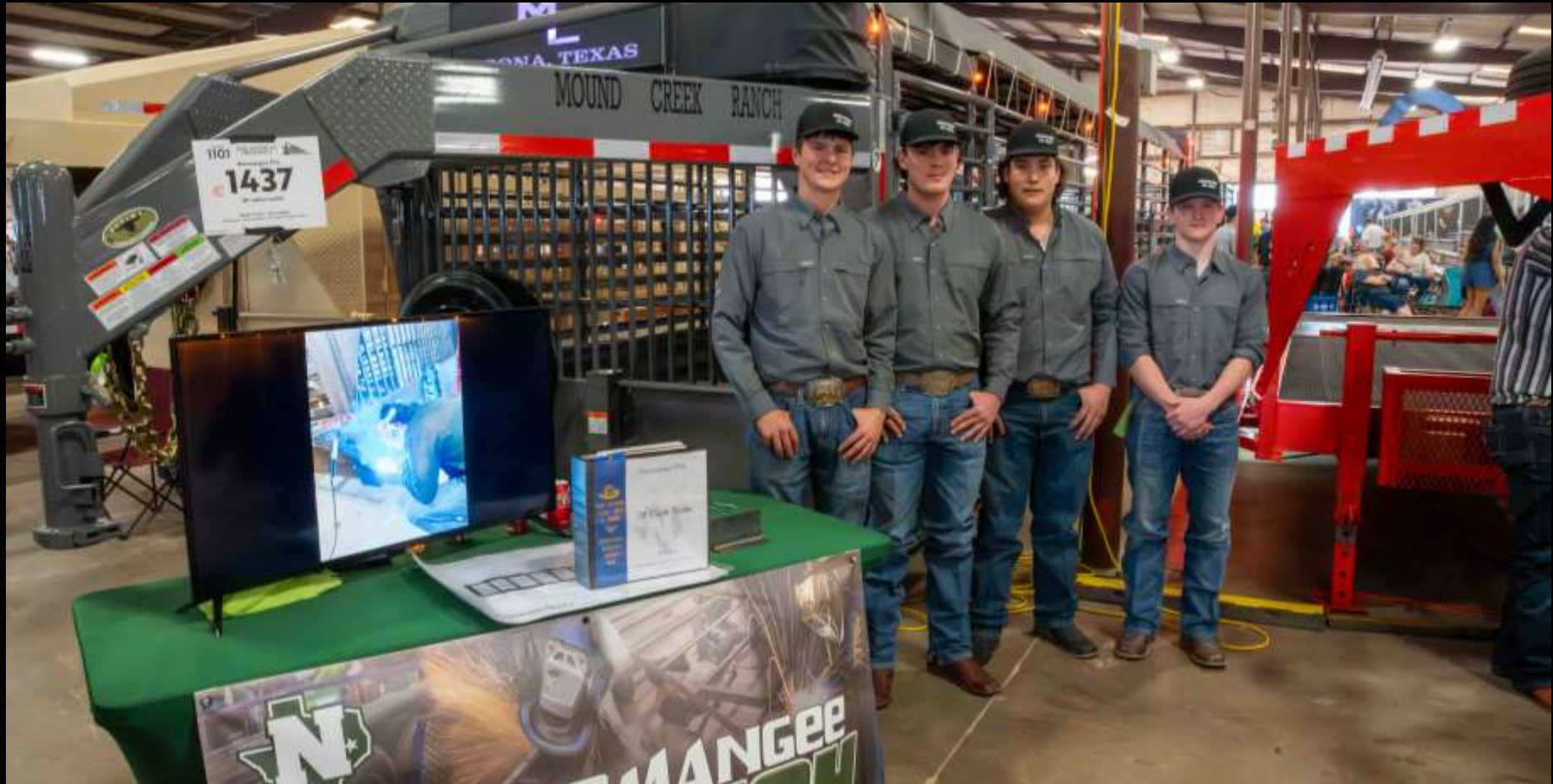
Class 1101 – Stock Trailer – all lengths