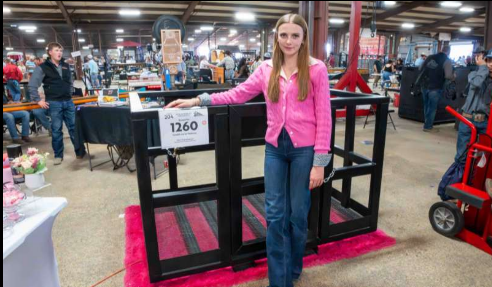
Class 204 – Other Shop Equipment