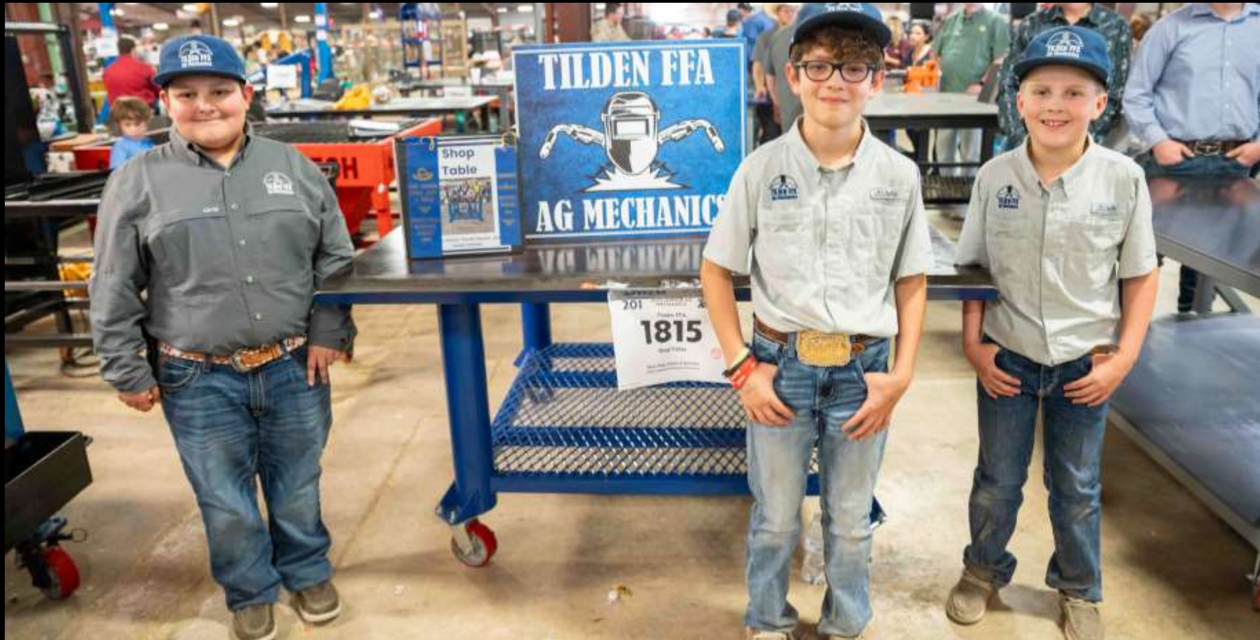
Class 201 – Basic Shop Tables & Benches