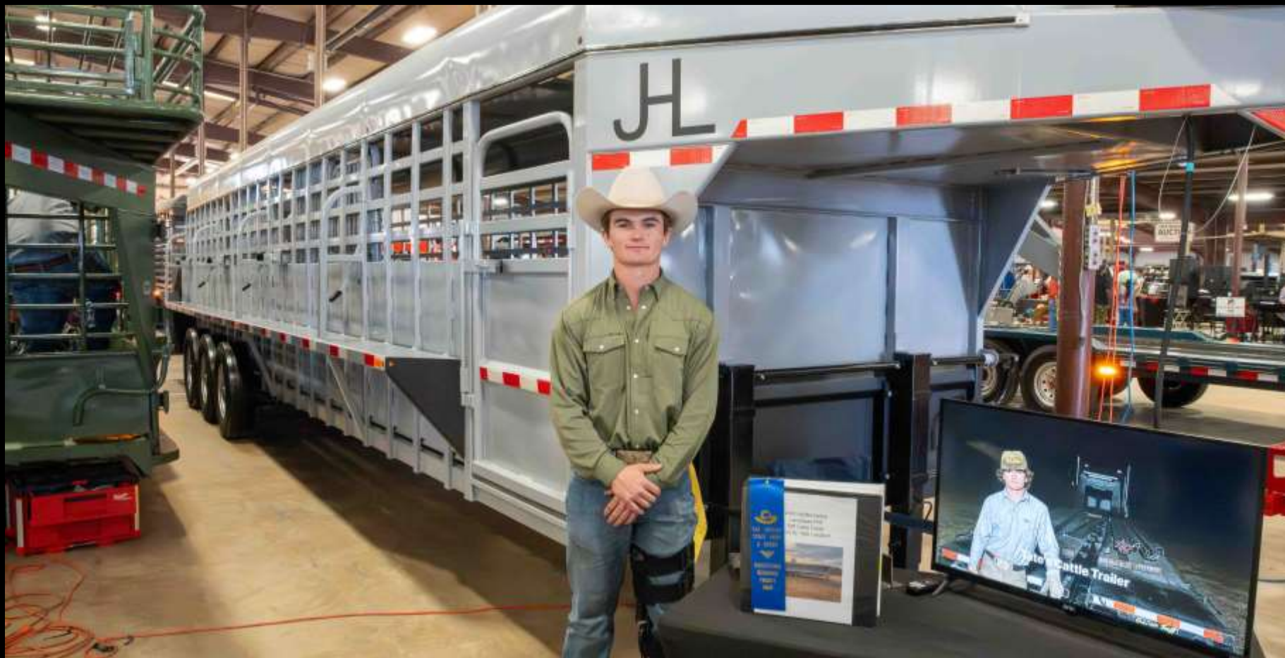
Class 1101 – Stock Trailer – all lengths