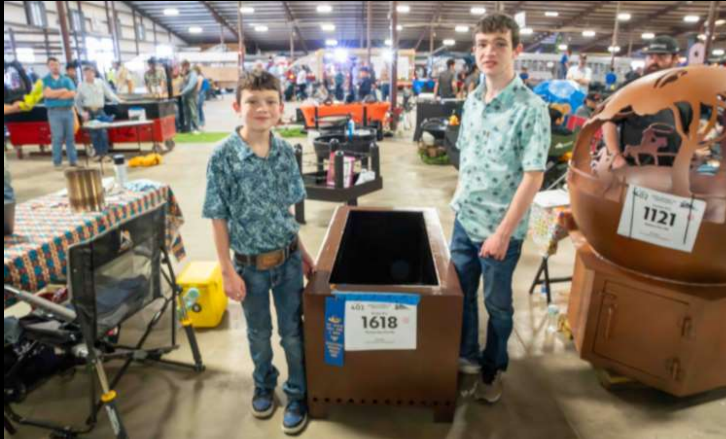
Class 402 – Fire Pits