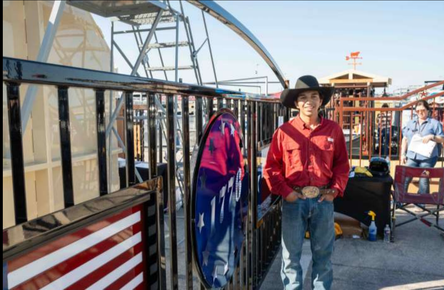
Class 601 - Gates