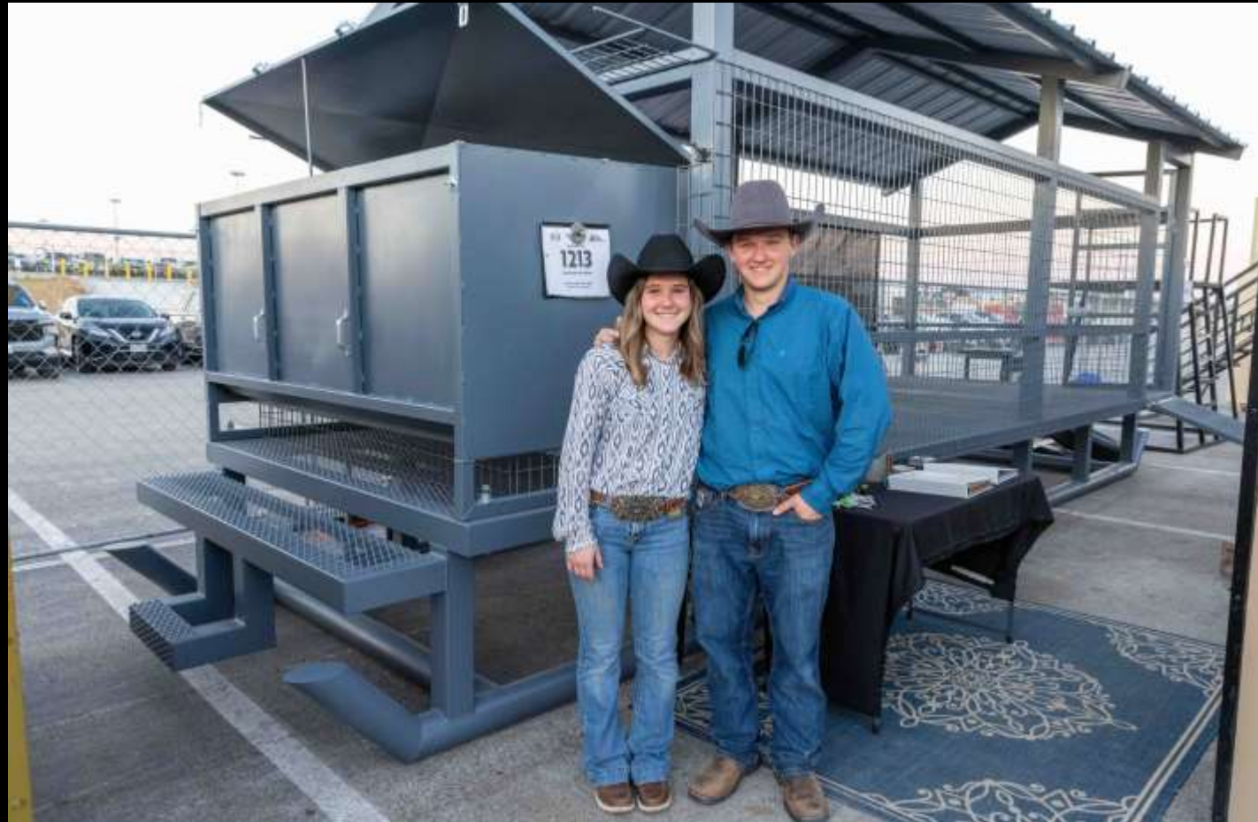
Class 703 – Other Livestock Equipment