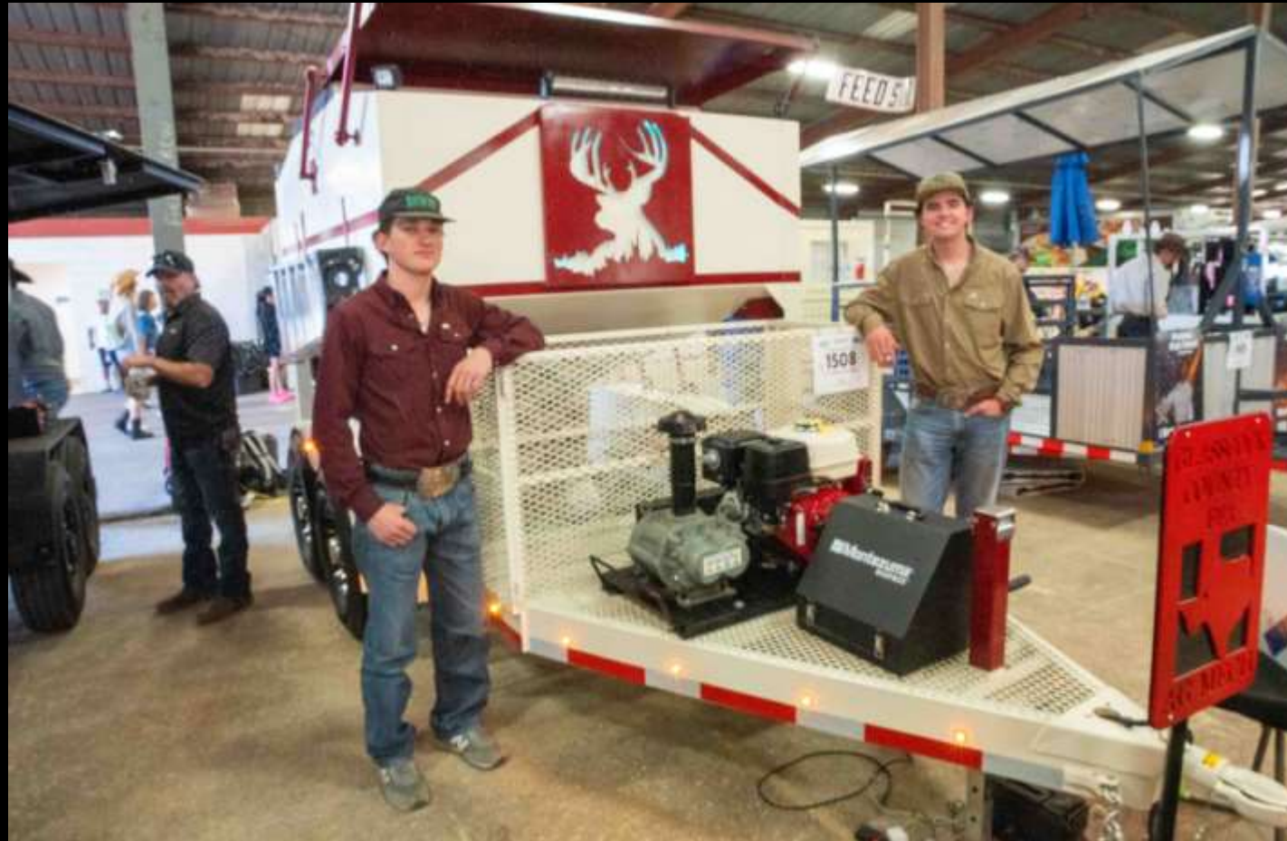
Class 904 – Other Bumper Pull