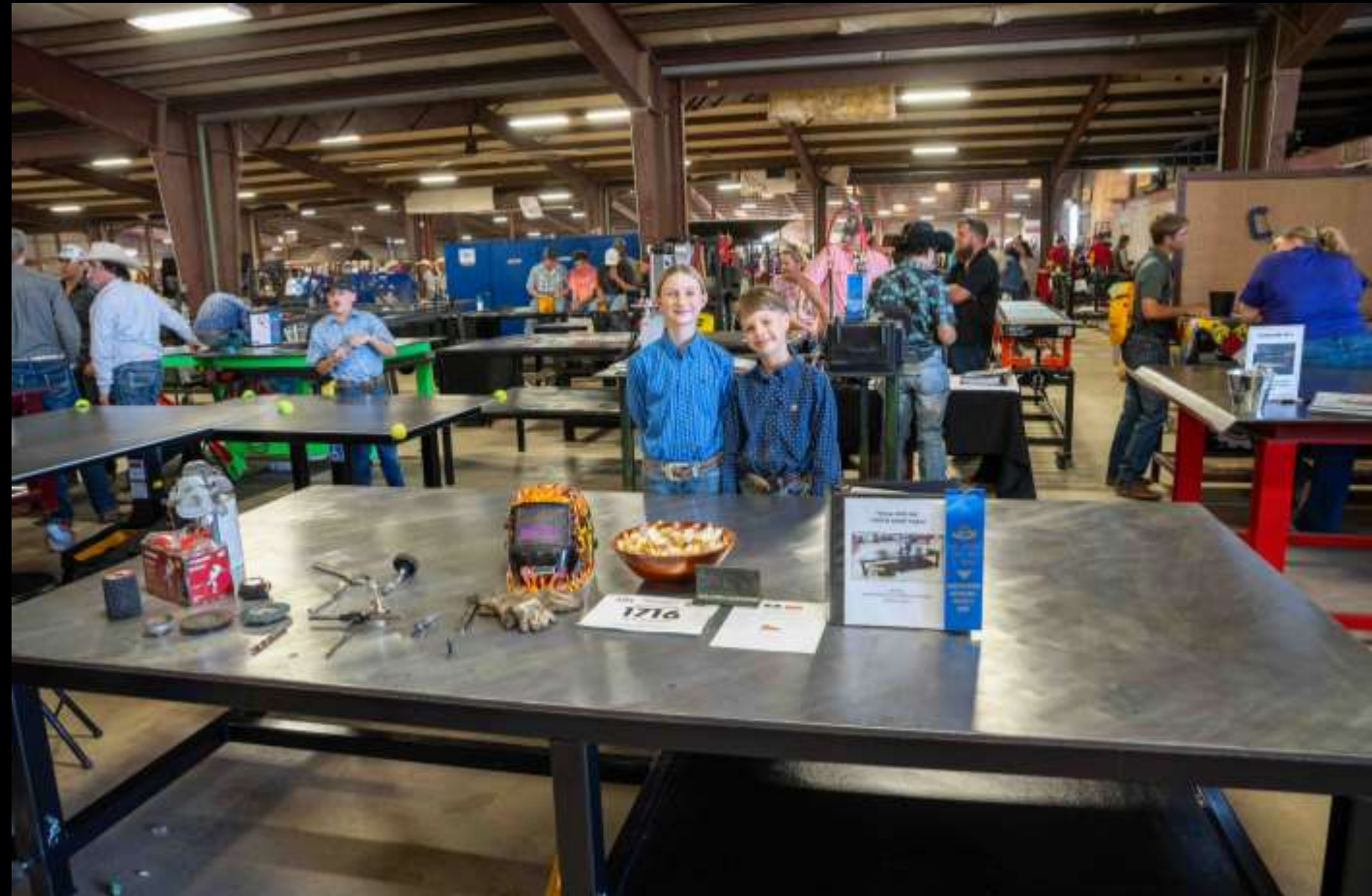
Class 201 – Basic Shop Tables & Benches