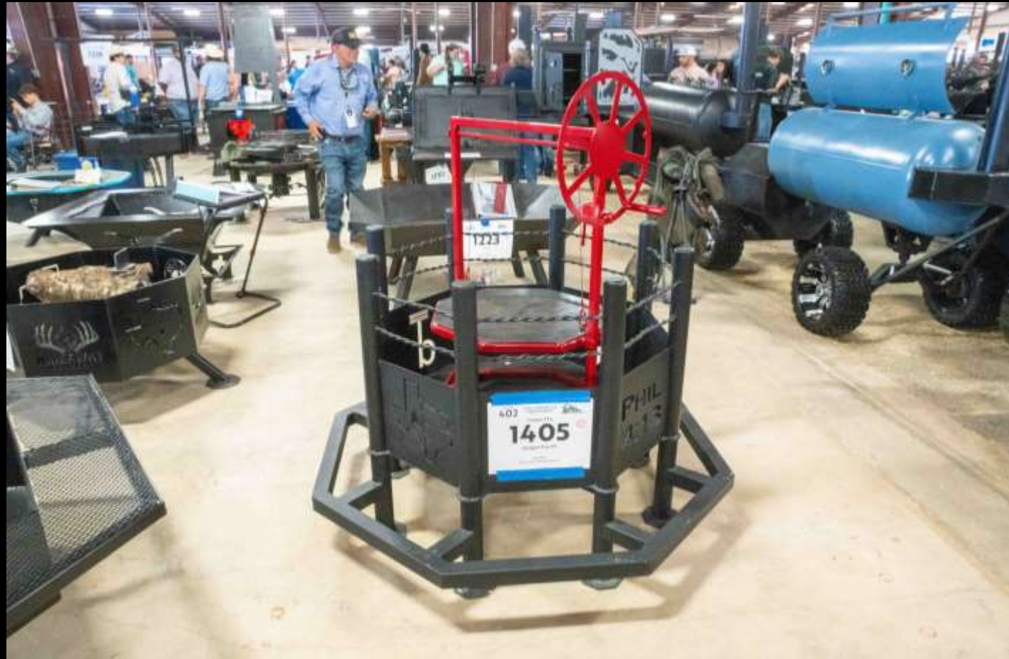
Class 402 – Fire Pits