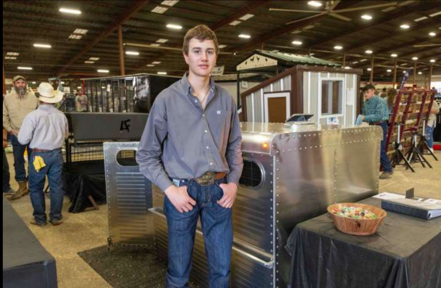
Class 604 – Trim Chutes, Blocking Stands, Livestock Crates