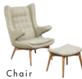
Chair Papa Lounger from Comfort Design

Simple does it. Timber decking and grass turf that are reminiscent of the great outdoors accompany those who wish to unwind on the comfy lounger to take in the calming view and enjoy the breeze. In case of a sudden downpour, motorised blinds can be easily activated.