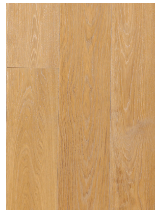
Jubilee Bay Oak | French