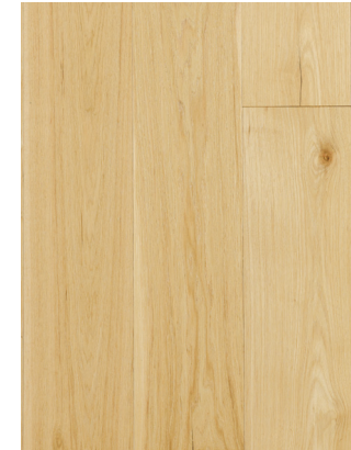
Golden Sapphire Hickory | North American