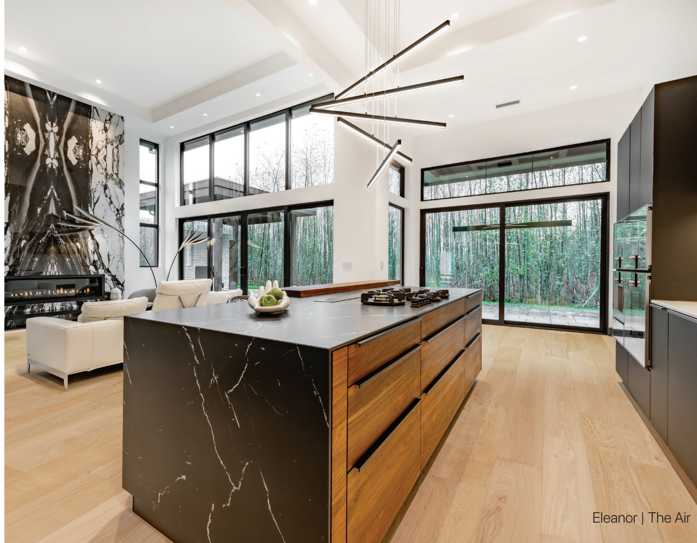
Eleanor | The Air