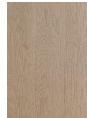
Iconic Oak | French