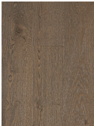
Twilight Oak | French