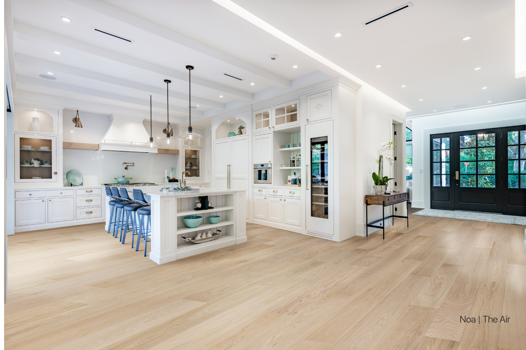
Noa | The Air