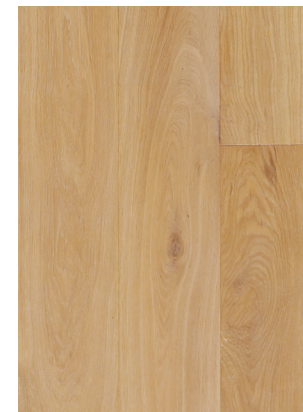
Dusk Oak | French