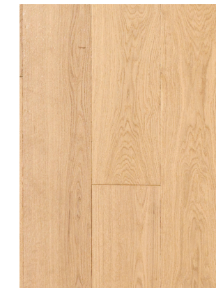
Lumina Oak | French