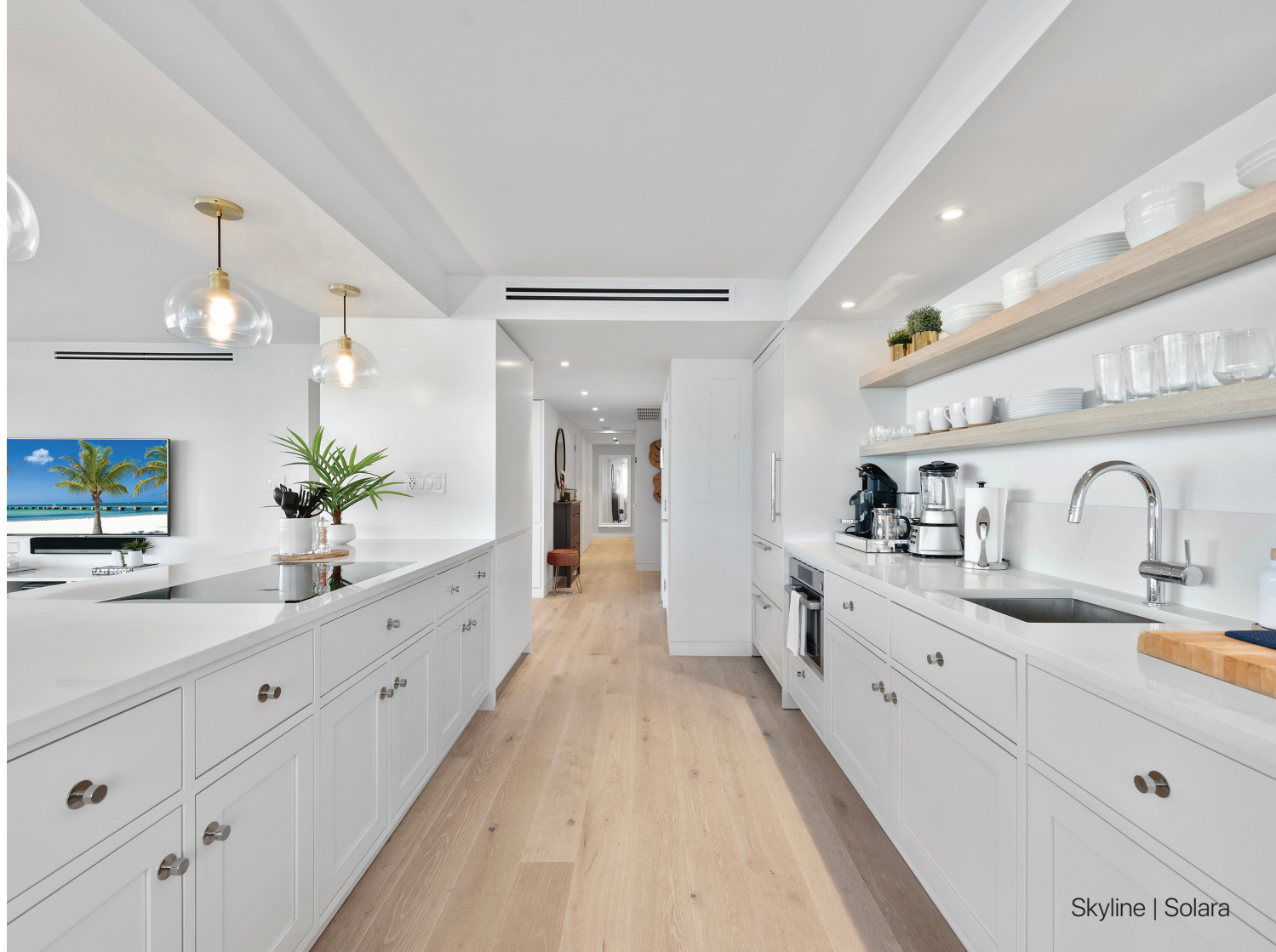
Skyline | Solara