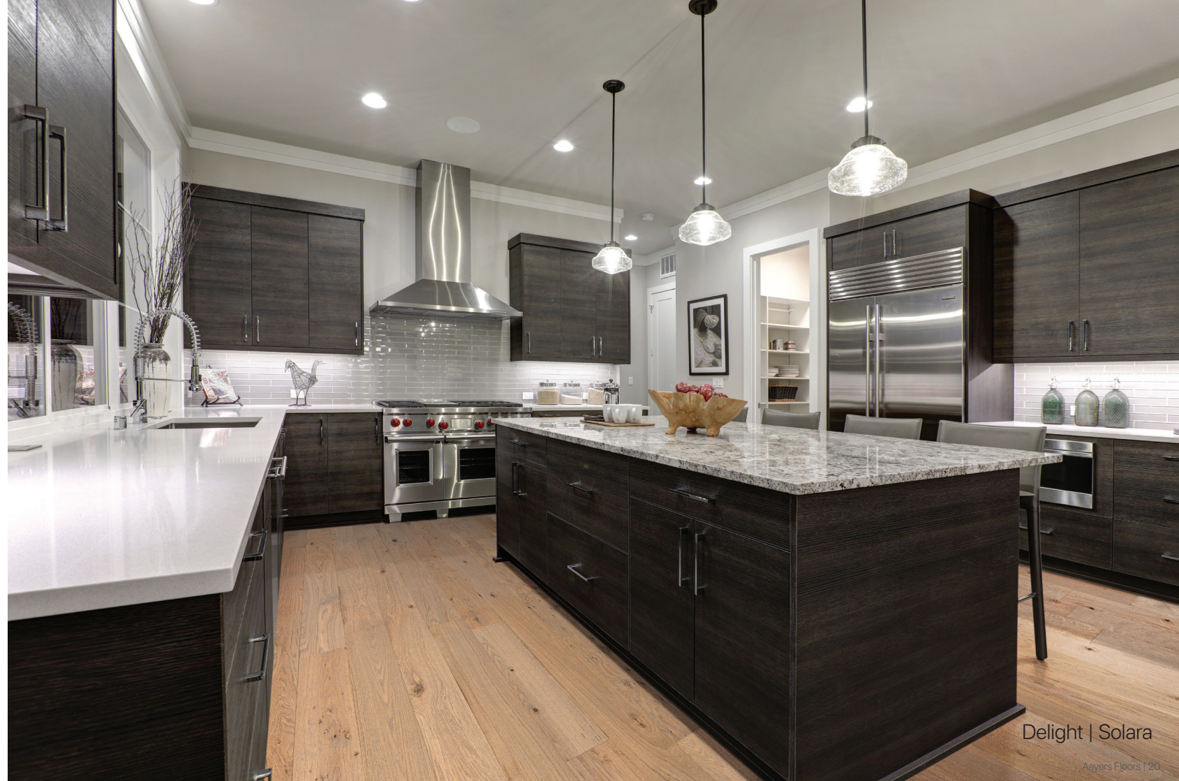
Delight | Solara