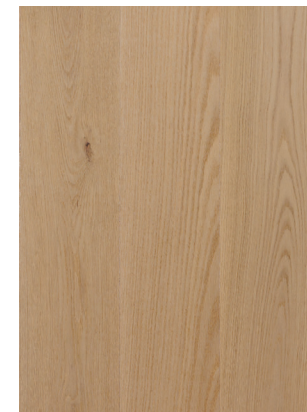
Isla Oak | North American