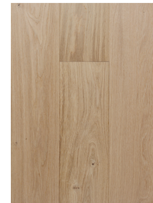
Coralstone Oak | French