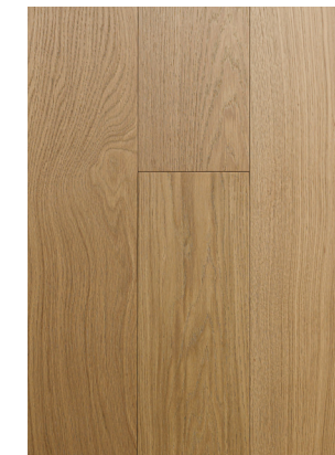
Mirage Oak | French