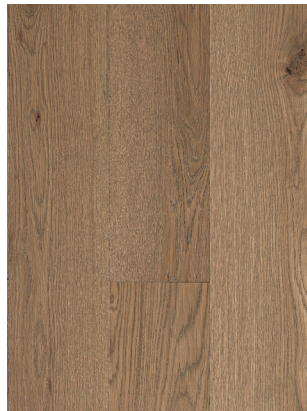
Aura Oak | French