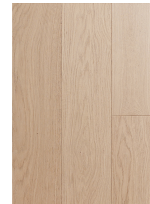
Pristine Oak | French