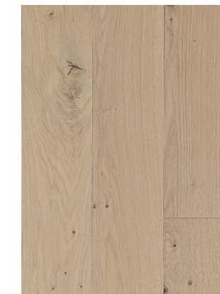
Opulence Oak | French