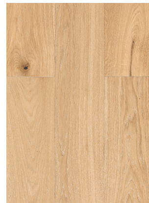
Driftwood Oak | French