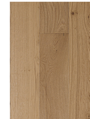
Radiance Oak | French