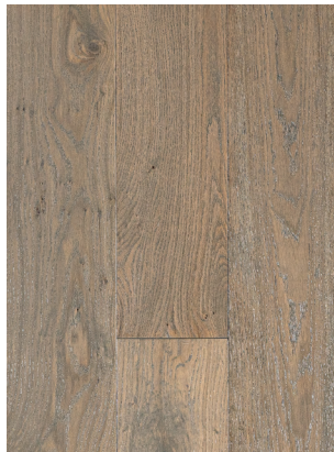
Delight Oak | French

Ultra Matte Finish enhances the natural beauty of wood. Perfect for high-traffic homes with kids and pets, it requires less maintenance and effectively conceals imperfections, dirt, and dust.