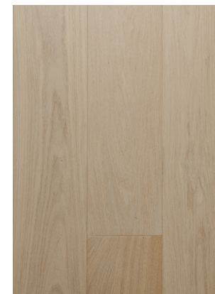
Pearl Coast Oak | French