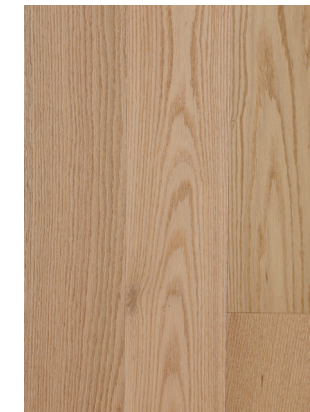
Noa Oak | North American