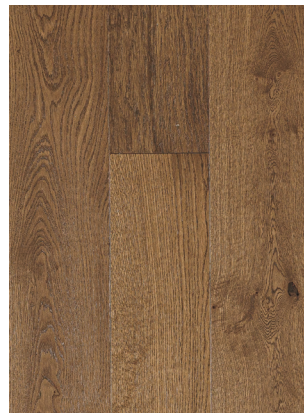
Bliss Oak | French