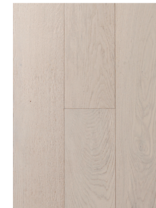
Nova Oak | French