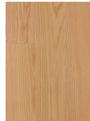
Aria Oak | North American