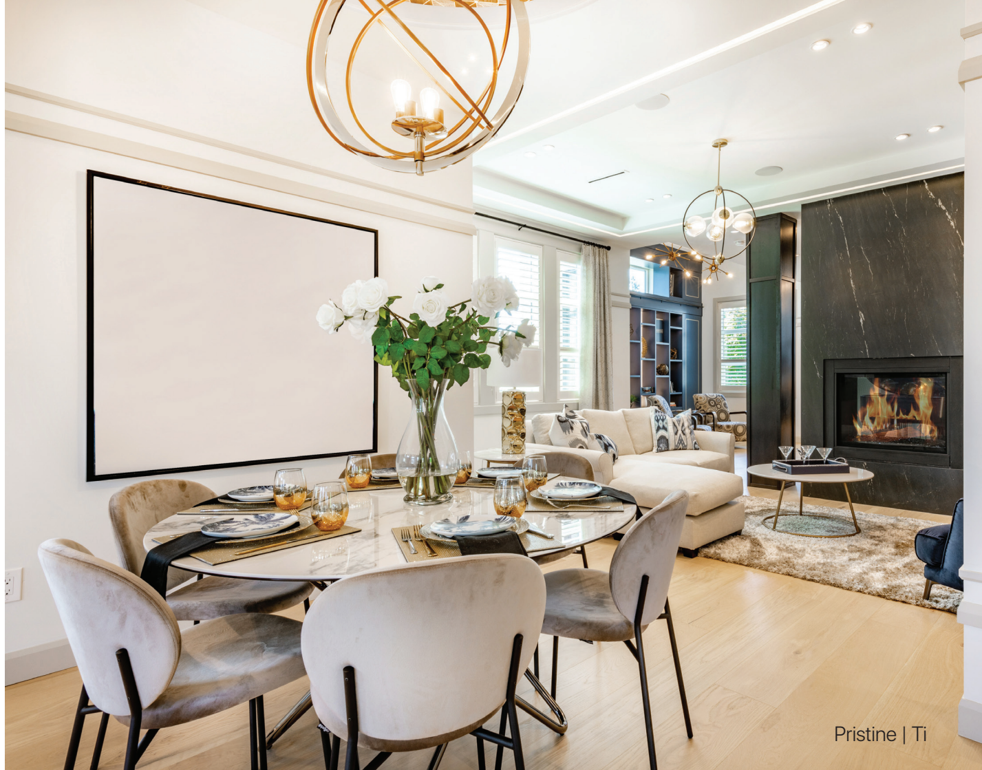
Pristine | Ti