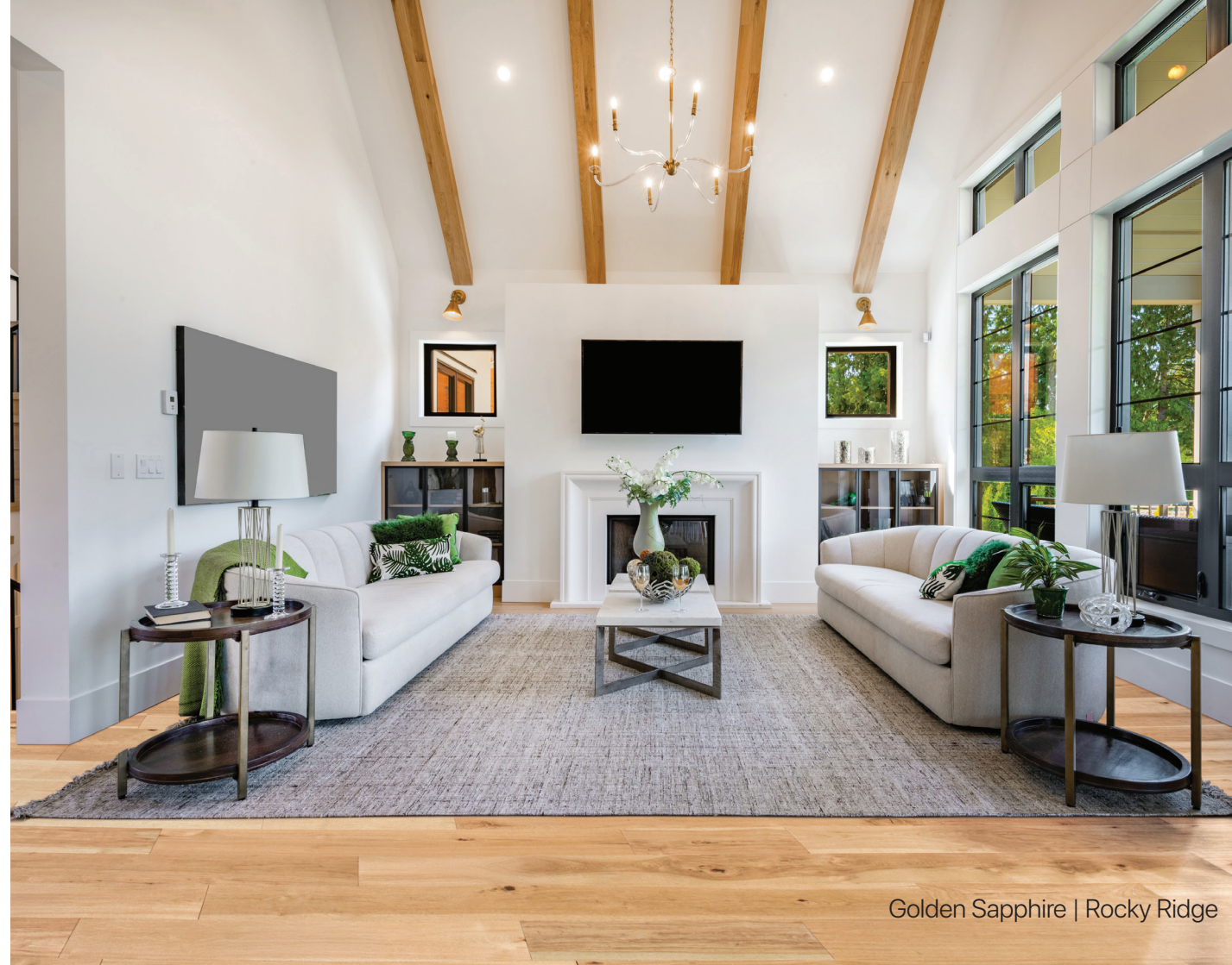
Golden Sapphire | Rocky Ridge