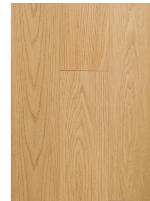
Eleanor Oak | North American