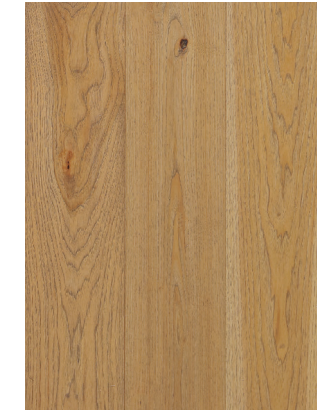
Pumice Hickory | North American