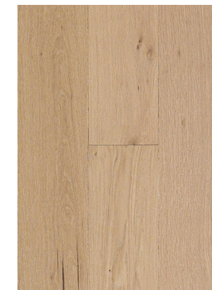
Skyline Oak | French