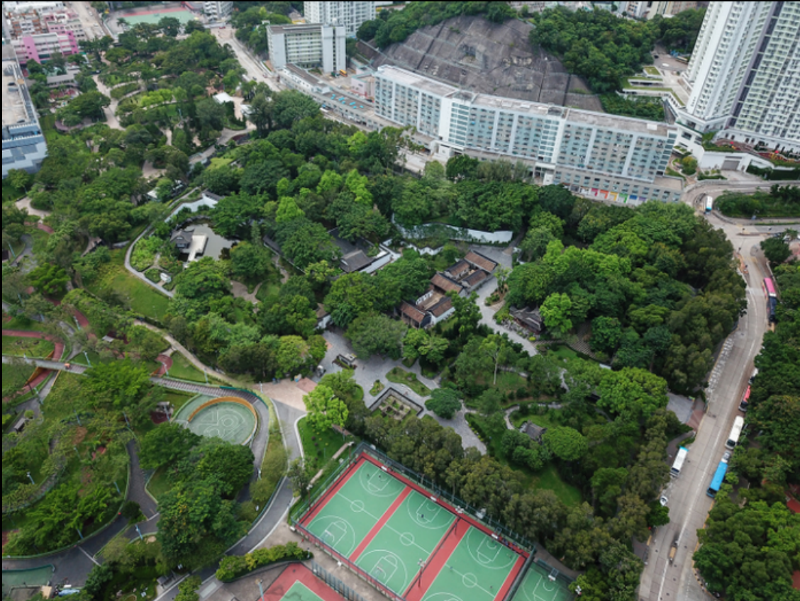
Arial view of Kowloon Walled City Park

Despite the peculiar yet contained nature of the Walled City, the population growth eventually became too big for the government's liking. Plans to demolish Kowloon became public in 1987, with Britain and Hong Kong forces following through just a couple years later in 1994. It was replaced by a park which is open to visitors today.