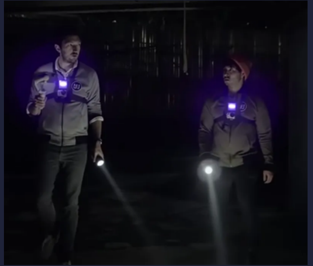
Ghost Files, 2022

There is a scientific aspect to ghost hunting that support Sims' stance. While they aren't conclusive, evidence gathered by infrared cameras, electromagnetic detectors, and ion detectors have all shown to possibly capture the energy left behind by someone who has died; that however is still speculative.