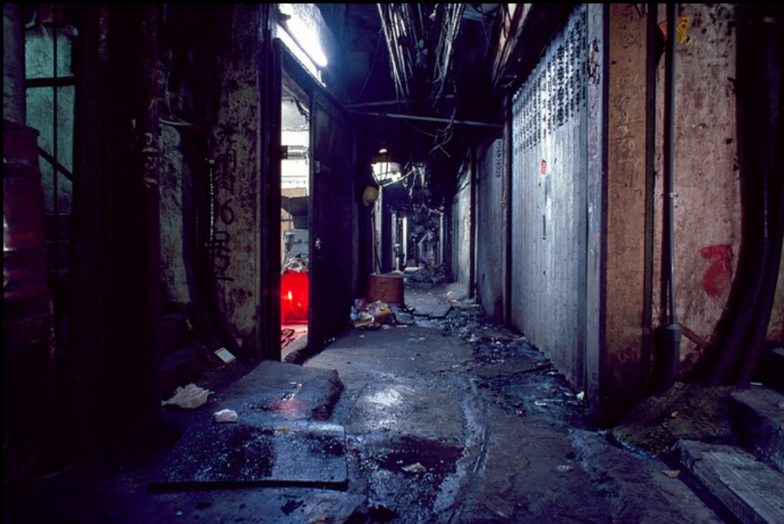
One of Kowloon's many back alleyways

The lack of leadership from the governments in control of Kowloon was directly responsible the intervention of the Triads, Hong Kong's criminal mafia. They saw Kowloon's potential as a den for their crime ring, and quickly established their power over the residents. Through their control, Kowloon became known as a drug haven, among its other reputations, because of the opium pushed by the 60 Triad gangs found throughout the city. But the Triads were not content with just pushing the drug trade; A multitude of avenues for otherwise illegal business was foreseen as well. From gambling to drug-divans, prostitution and extortion, the fear of Kowloon talked about by outsiders was certainly mostly founded in truth. A lack of a real police force meant crime was high, although Triad protection services within Kowloon created some sense of order, if only by fear of retaliation.