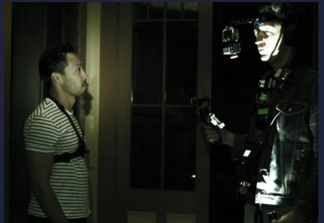
Buzzfeed Unsolved: Supernatural, 2016