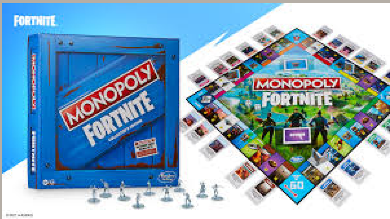
Fortnite Branded Monopoly

With underwhelming content coming from the game in 2019, Fortnite ramped up the number of crossovers, especially in the form of buyable character skins and other cosmetics in their item shop. These crossovers helped Fortnite retain their profits numbers, and also piqued the interest of fans of the franchises partnered with Fortnite- Imagine talking to a friend about the new Deadpool Crossover, something that is almost unbelievable! Many crossovers are also linked to the battle pass, making them limited time, and so players have to buy passes to get their favorite characters.