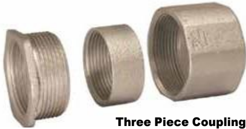
Three Piece Coupling